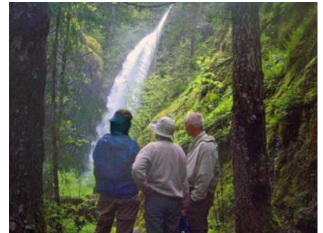
Henline Falls – Little N. Santiam

Our lunch stop view was cascading triple falls across the river. We finished the 4 1/2 mile hike to drive down to the river on the opposite side to see the three emerald green pools connected by waterfalls. The final highlight of this outing was the one mile walk into Henline falls.