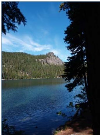
Pulpit Rock above Rosary Lakes

BECAUSE AS LEADER I like to keep things interesting, I locked my car keys (along with two other hikers' belongings!) in the trunk before the trip even began! A kind, flexible group helped make this work. One car with five hikers left, while two of us waited for the locksmith. About 45 minutes later, we were on our way! We caught up with the original five just as they were beginning lunch -- perfect timing, since in penance I had carried the additional backpack (containing, among other things, the all-important lunch) that had been locked in the trunk.