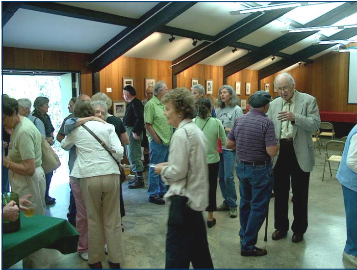
Friends, old and new, enjoy the new Lodge.