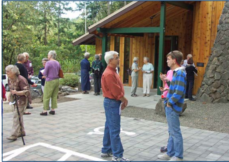
All enjoyed a beautiful day at the Lodge.

Later that afternoon, I was again standing by the wall when a man with a