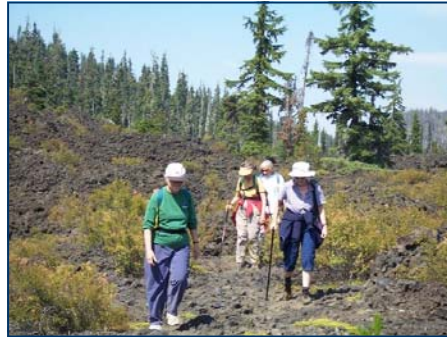
On the Old Wagon Road