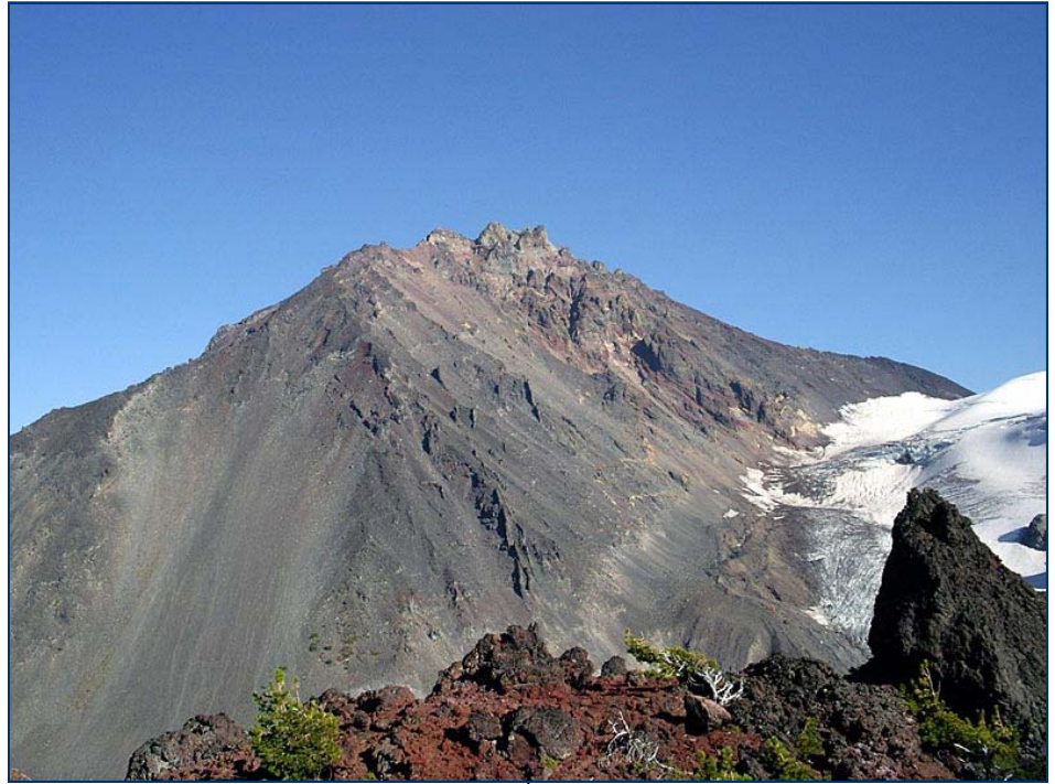
North Sister from Little Brother.

We left camp at 4:35 a.m. Sunday under a clear, moonless sky. I used a GPS track I'd made a week before to get us through the maze of pits in the cinder desert east of Collier Cone. Once on the ridge, the most difficult obstacle proved to be the section from the last gendarme to about mid-way below the Glisan Pinnacle, where the footing was sketchy at best and the ability to protect nonexistent. Two ropes were used to protect the trav-