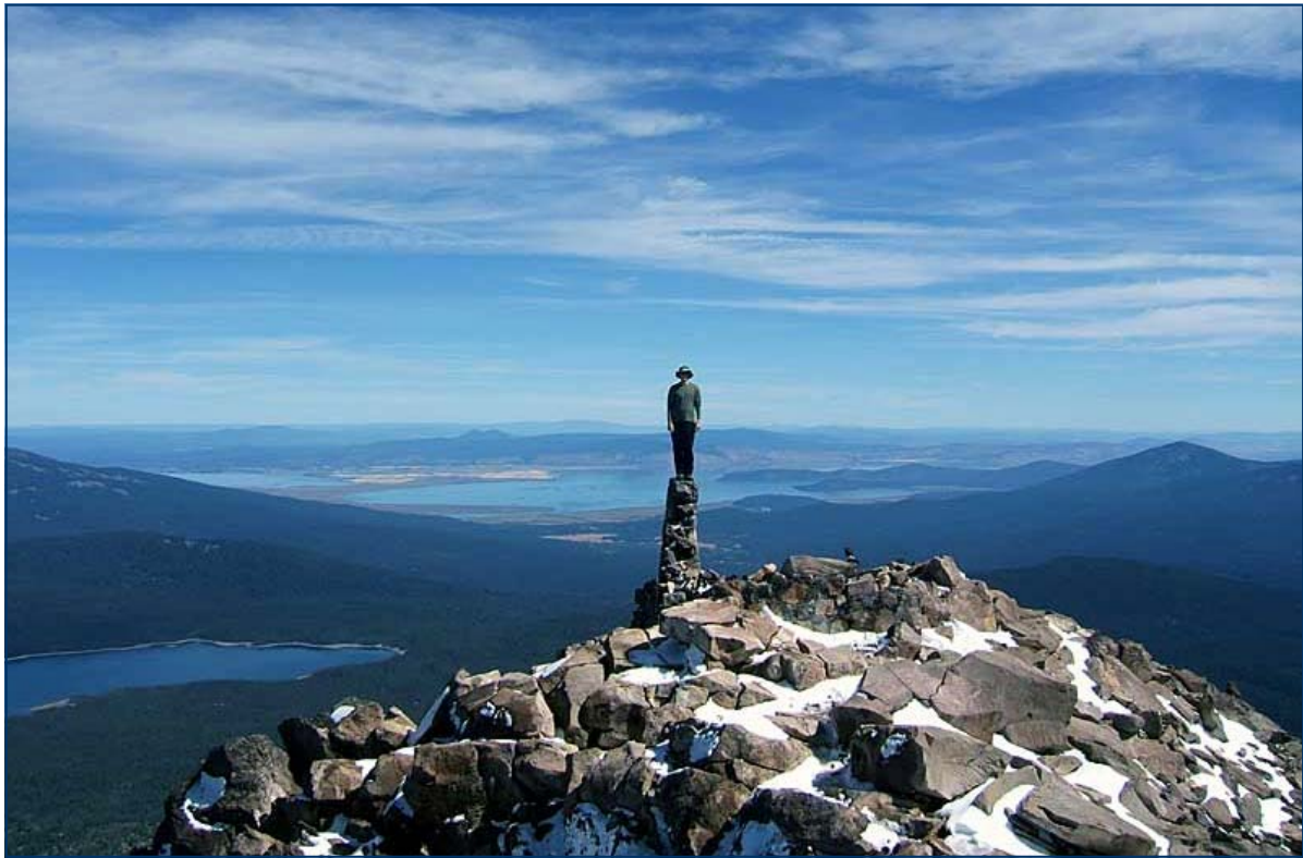
Chance Fitzpatrick on Mt. McLoughlin. See climb report on Page 18.