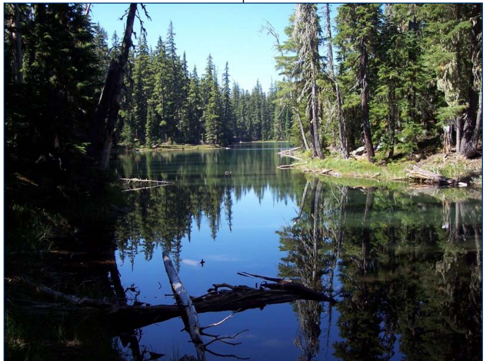
Meek Lake along the trail to Windy Lakes

A couple of miles of easy and incredibly scenic trail brought us to the base of 7,664 ft. Cowhorn Mountain and the obvious climbers' trail to the summit. Forest fires made the air very hazy and obscured