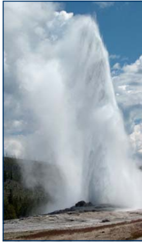
Old Faithful