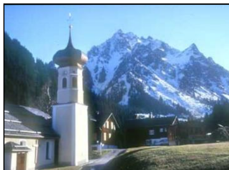
Gargellen, Austria

Bring your favorite potluck dish to share...along with your own plates, utensils and cups...plus $1 to help cover club expenses. Parking at the Lodge can be crowded. Please consider carpooling.