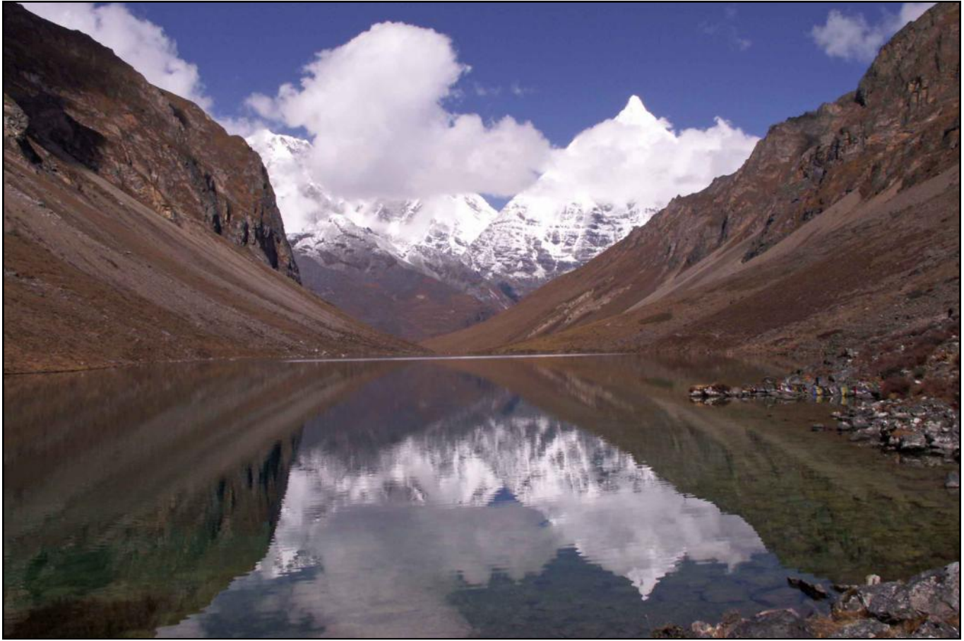
Tshophu Lake in Bhutan - See story on Page 4