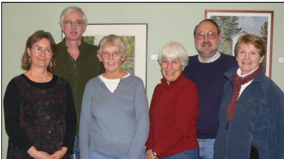
The 2008 Obsidian Bulletin editorial team, from left: