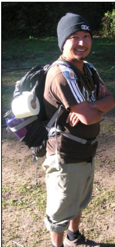
Well equipped guide.

the valley where we had camped, but the distant peaks were soon lost to sight. We had another tough day, with