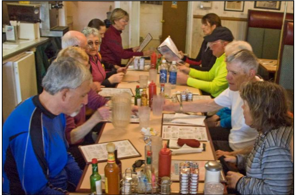
Biker chow-down at Sunrise Cafe in Pleasant Hill.

We bike for the companionship, the exercise and the scenery . Both the Obsidians and the Spoke Folk are focused on the pleasures of the ride and not its speed. We get there when we get there. We do get plenty of exercise, though. One of the great things about biking is the exercise is low, if not no