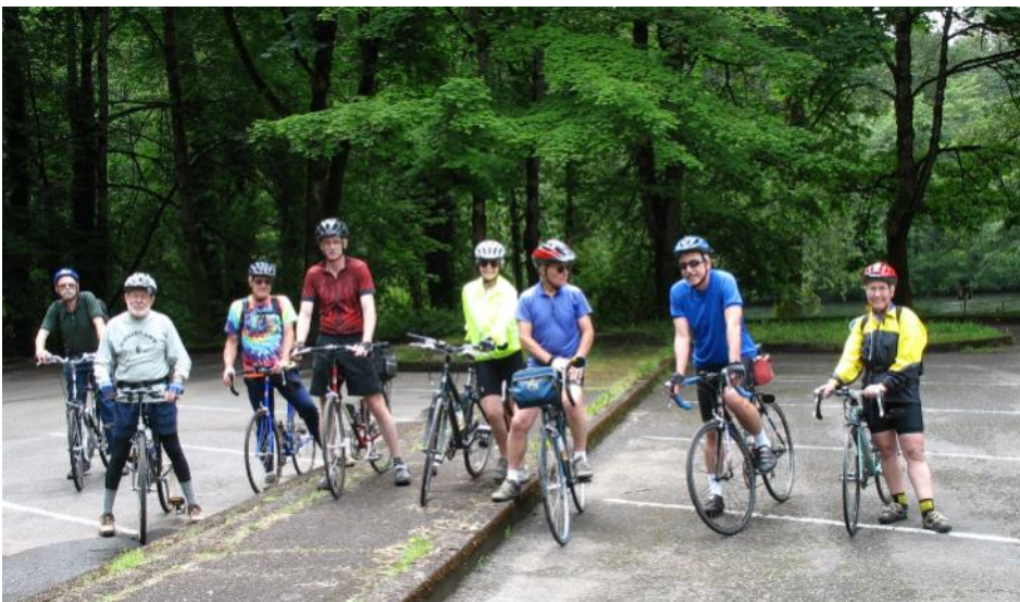
A stop along Camp Creek ride in June of 2006.

A final reason for biking is its low carbon footprint . You can visit points as diverse and distant as Alvadore, Brownsville, Coburg, Corvallis, Cottage Grove, Creswell, Crow, Loraine, Pleasant Hill and Veneta without using your car!