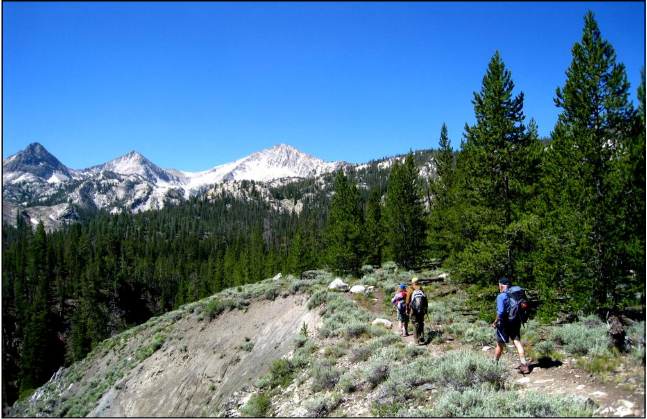
Hiking in the White Cloud Mountains, Idaho, Obsidian Summer Camp