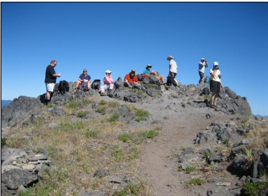
Atop Horse Pasture Mountain.

WE HAD PERFECT CONDITIONS for a hike - a cooler-than-usual summer day. There seemed to be more water crossings than last year, and a muddy, boggy portion as we were exiting Paddy's Valley. Fortunately, we had very few mosquitoes (we had heard that other trails were full of them) as we hiked through a variety of environments from deep woods with bubbling river to higher and drier areas. Hik-