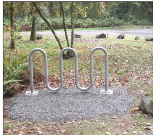
The newly installed bike rack