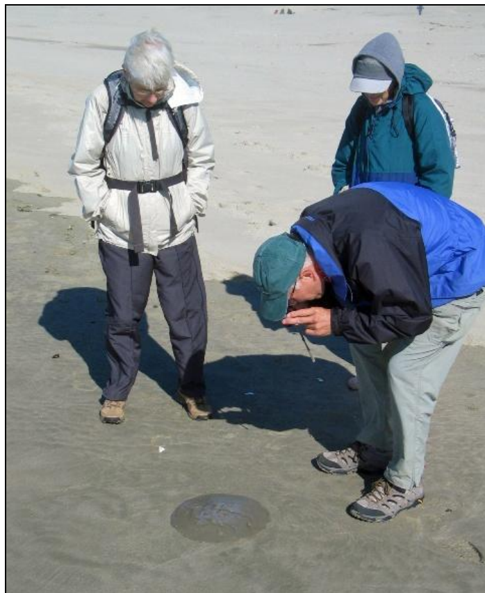
Photographing jellyfish - Baker Beach - October 8, 2009

DURING A FAIRLY RAINY WEEK, nary a drop fell upon our heads during our daily four-mile hikes on a variety of Pre's Trail and River Trail routes. Indeed, the sun had us shedding layers as we basked in what was once called "Indian summer" weather.