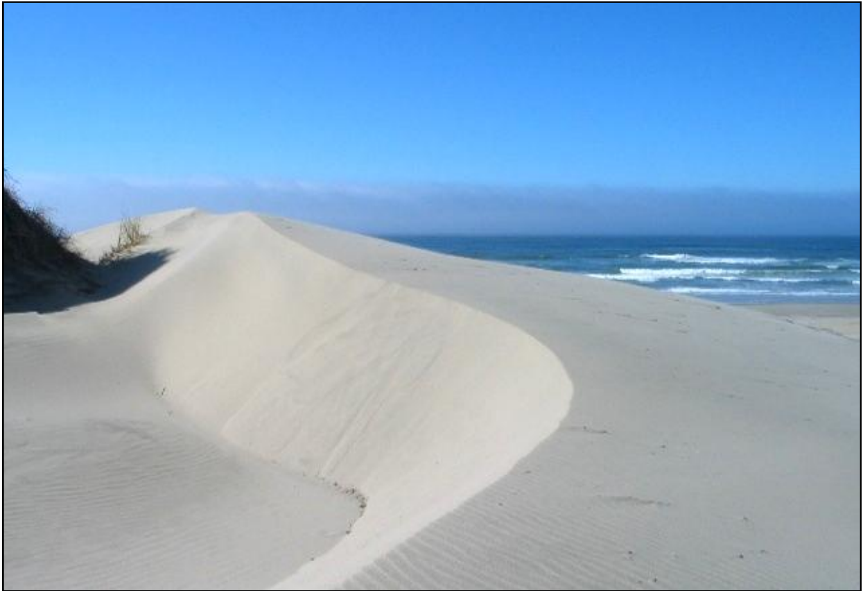
Baker Beach (See trip report on page 11)