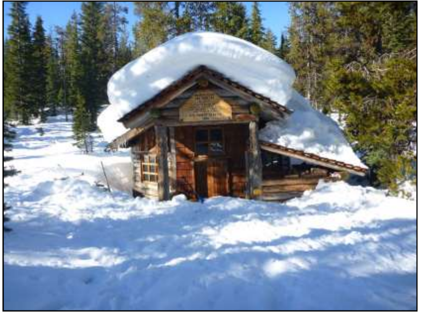
Maiden Peak shelter

I'M NOT REALLY SURE IF OBSDIAN trips can count if you are your only participant but I still went on this trip as planned. I set out at 6 am from Eugene. I began snowshoeing up Gold Lake Road a little before 8 am. Although it had rained several days during the week, Saturday was a beautiful day to snowshoe in the Cascades. The snow was definitely compacted and crusty from the rain and the number of skiers and snowshoers that use the road. All day there wasn't a single cloud in the sky. I easily