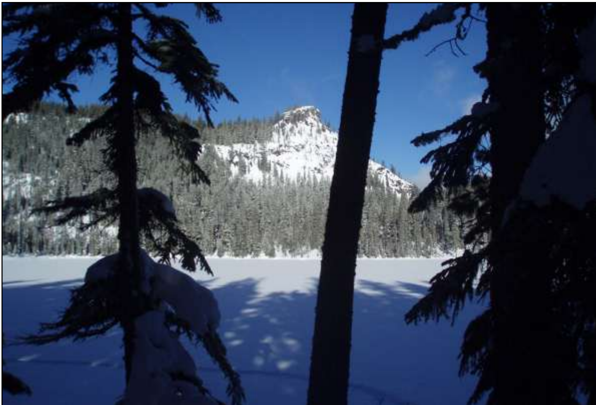
Pulpit Rock over Lower Rosary Lake

I LED THIS TRIP AS THE TRIP I THOUGHT I signed up to lead, which was not the same as the trip that people thought they had signed up for. I didn't update the trail miles or the elevation gain information from what the online sign-up system automatically adds for the Rosary Lakes destination. Because of this, people signed up for a moderate 6-mile snowshoe with 600 feet of elevation gain, when what they did was actually a difficult 8.5-