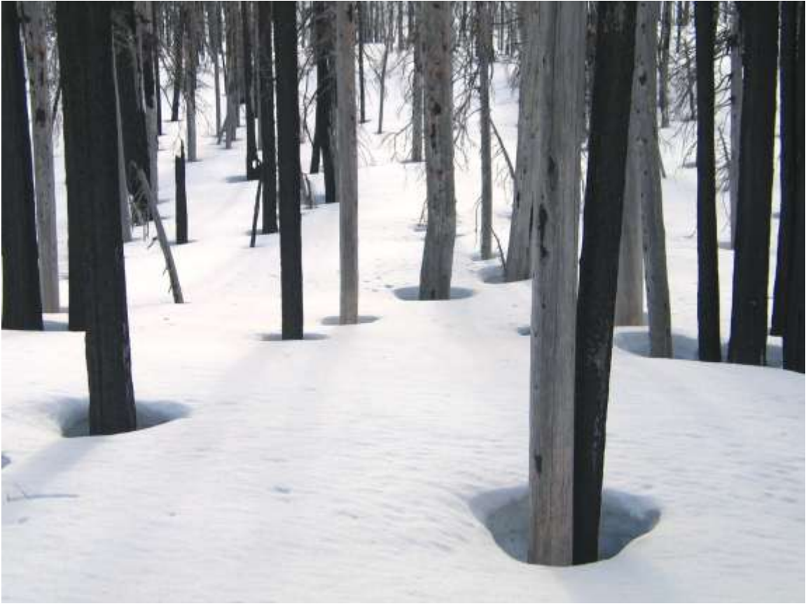
Tree Holes along the PCT near Santiam Pass, late January — Photo by Clare Tucker