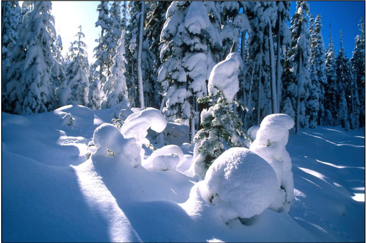
Snowmen dancing along FS 5890 near the PCT.