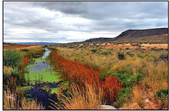
Malheur Wildlife Refuge