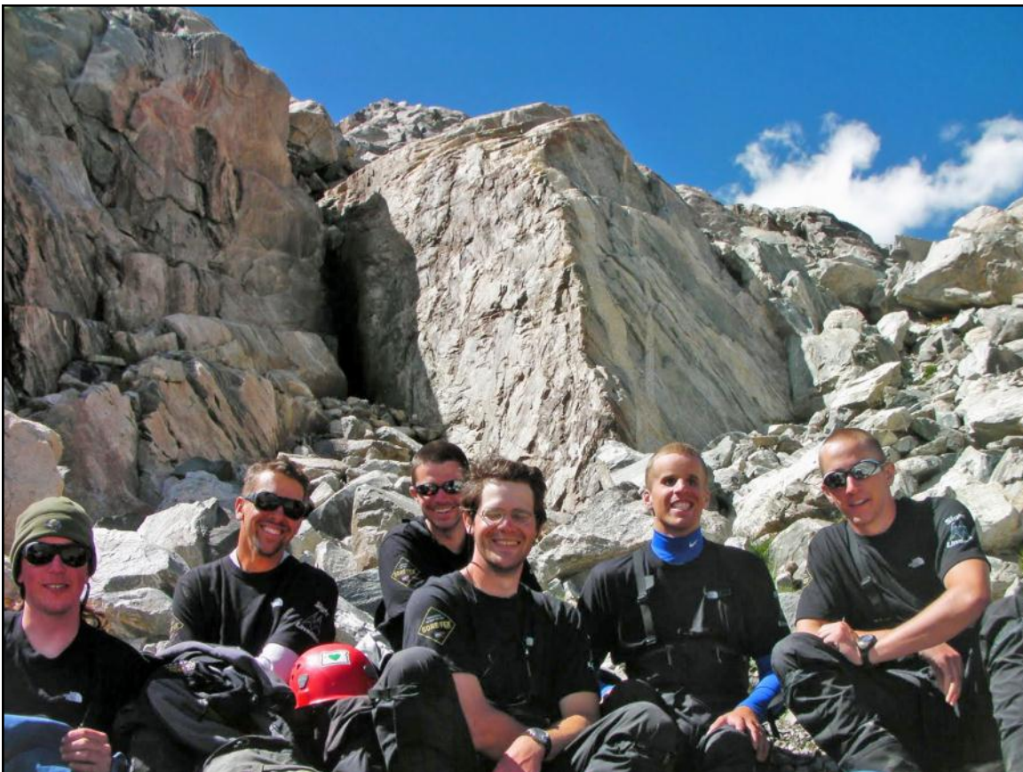
Team Sight Unseen near the summit of Gannett Peak.

This could not have been more true. I used the entire prize money to personally fund the 2010 team trip to climb Wyoming's highest mountain, Gannett Peak. In addition to the transportation, horse packers, and food for the climb, I was able to purchase new gear and clothing for each member of the team. The climb itself took a week to complete and was a grueling 50-mile round trip with almost 9,000 feet of vertical gain. We enjoyed the beauty of the mountains together, strengthened our bonds of friendship and trust, built new skills for future climbs, and hopefully set an example to others of what is possible when people work together toward a common goal. For more information on the climb itself, or to make a donation to help support our future climbs, please visit www.teamsightunseen.com .