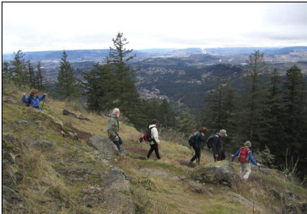
Coming off of Spencer Butte on February 5.

WHAT A GREAT DAY FOR AN OUTING. The coastal fog cleared as we finished. We stopped often to examine new ferns, trees,