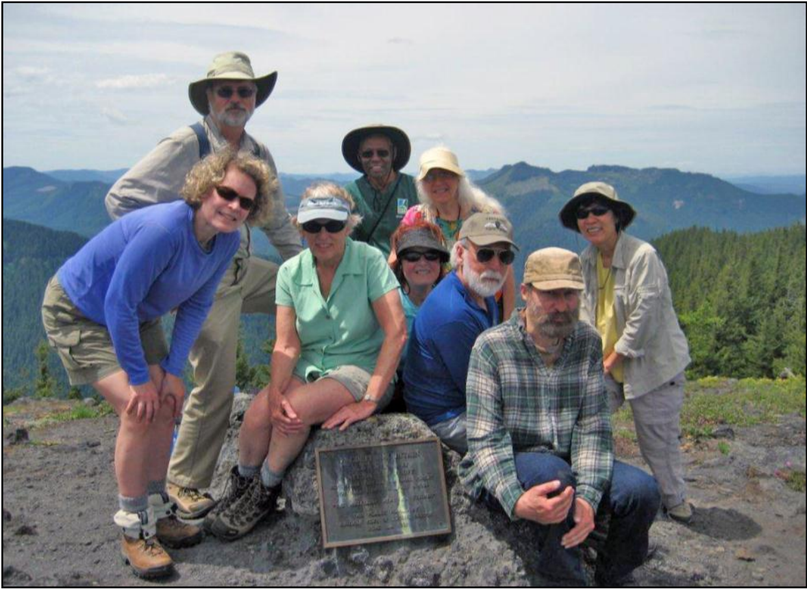
from successful hike of Macduff Mountain—see trip report on page 8.