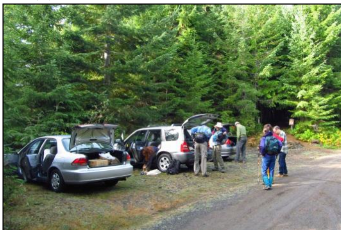
Obsidians gearing up for a hike to Tire Mountain On 10/14/2012 Photo by Holger Krentz

(Photo taken from new Obsidian photo gallery)