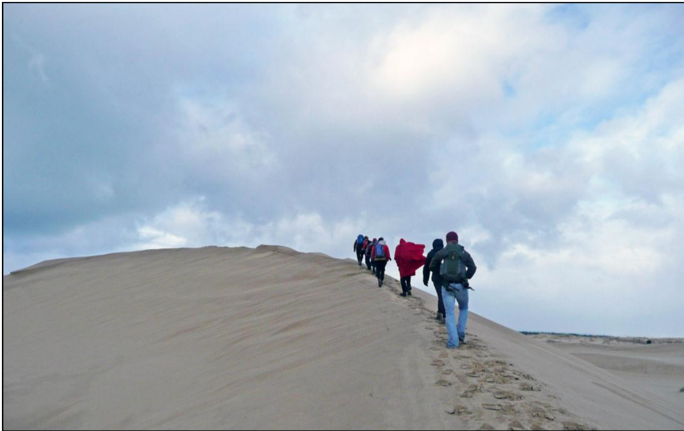
Dunes on December 2, 2012 Eel Creek Hike—Photo by Janel Laidman