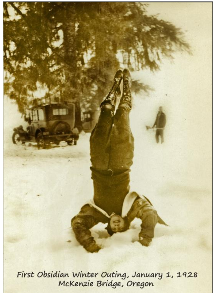
First Obsidian Winter Outing, January 1, 1928 McKenzie Bridge, Oregon