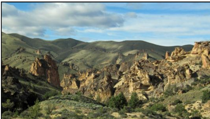
Photo of Leslie Gulch