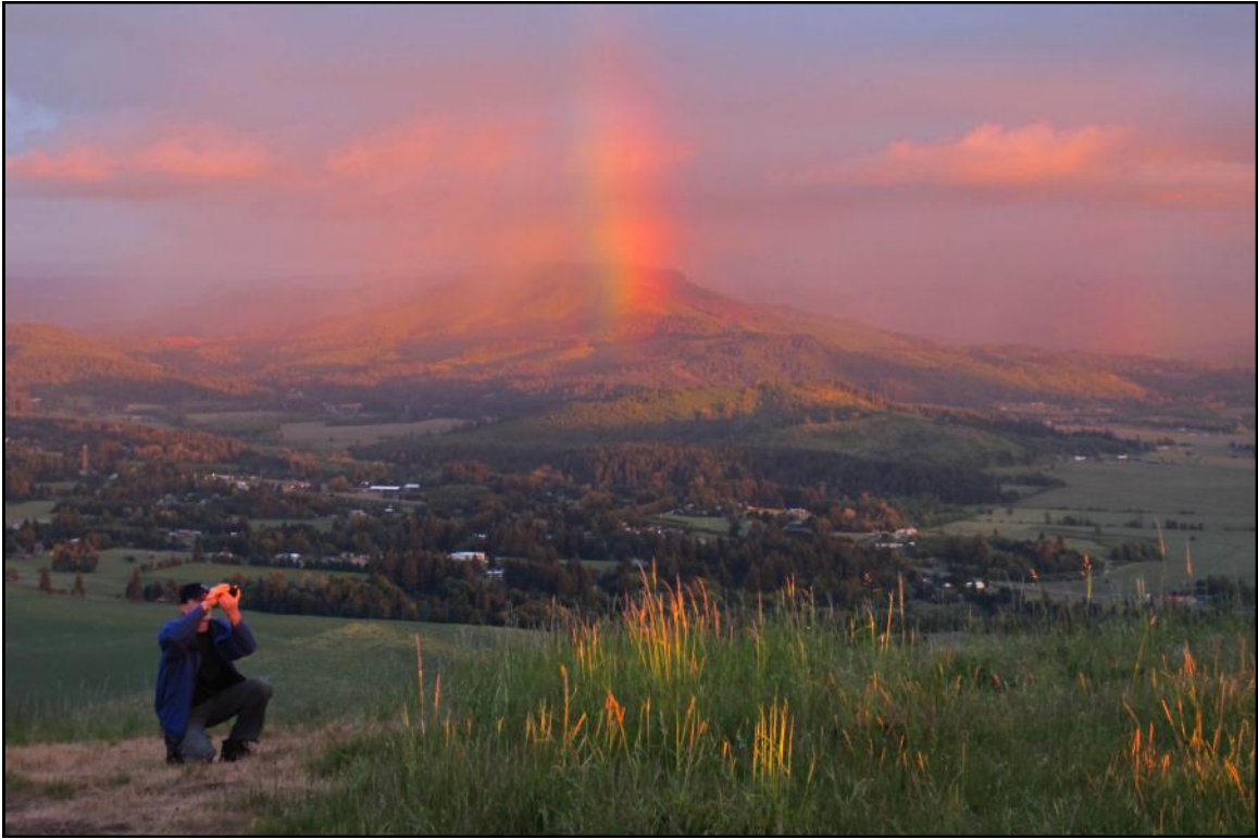
Sunset rainbow from Mt. Pisgah