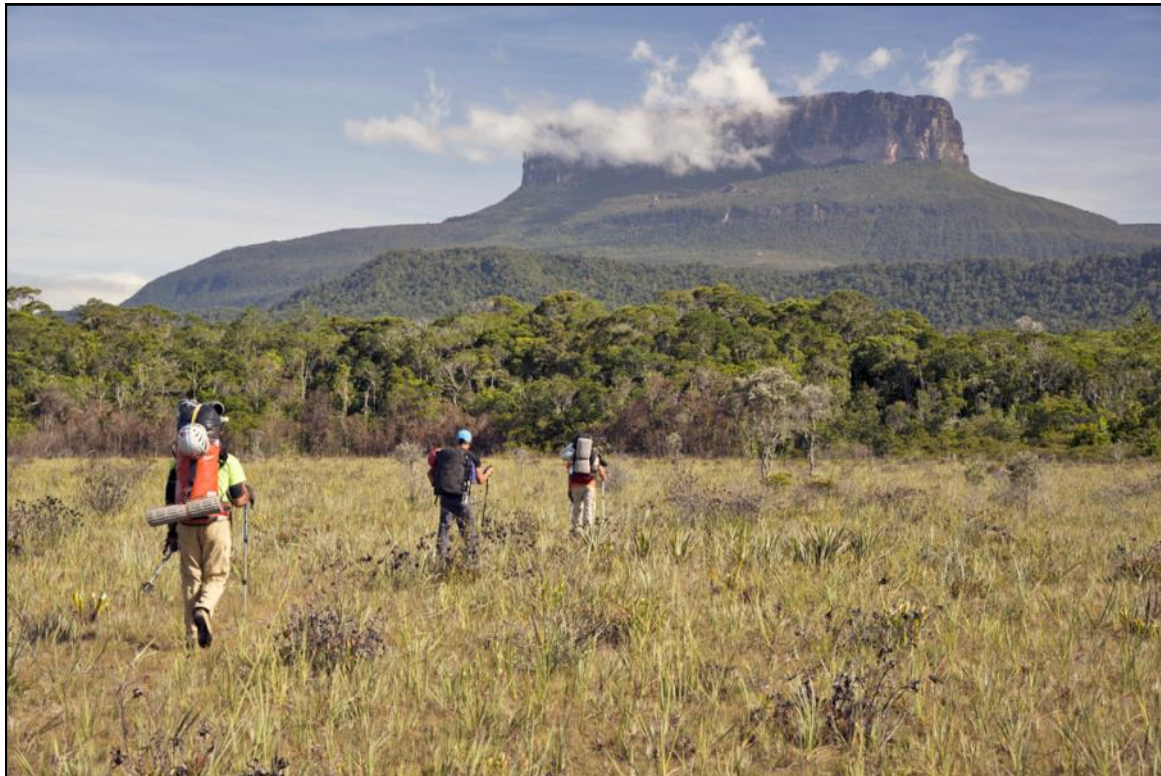
Mt. Ptari-tepui in Venezuela—hear about climb at May Potluck