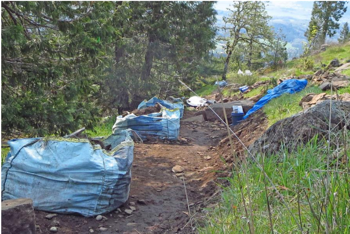
Construction on Spencer Butte