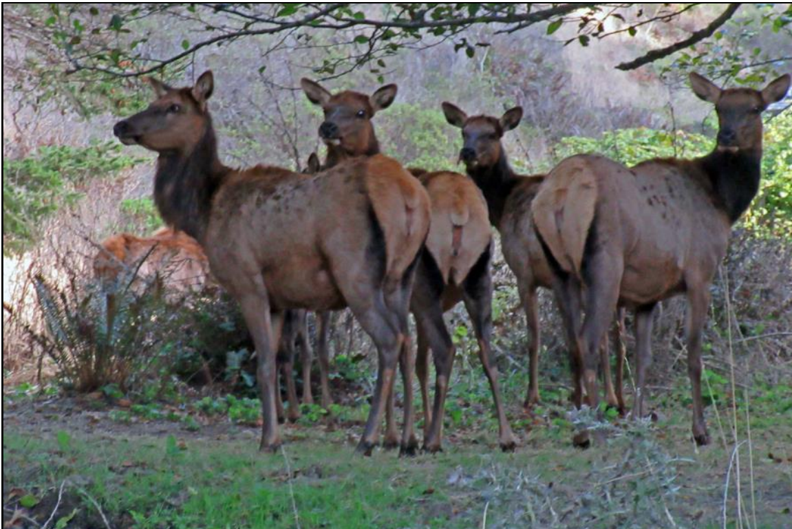
Nonmembers on Sinkyone backpack trip (See report on page 7)