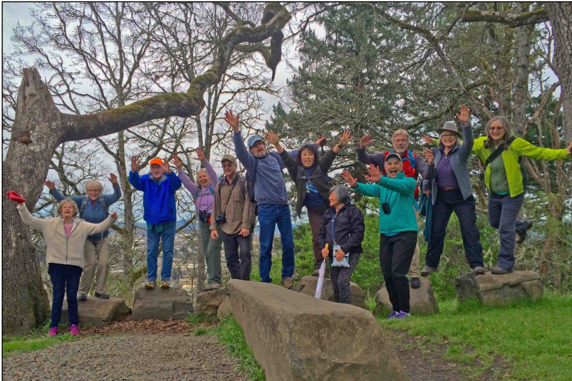
Leap year leaping on Skinner Butte (See trip report on page 8)