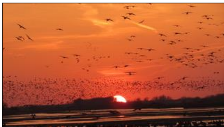
Sandhill Cranes at Row Sanctuary.