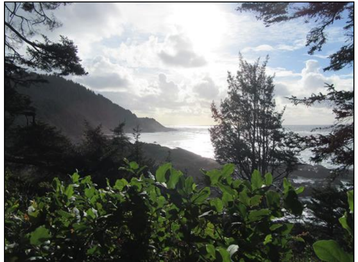
Ocean view from the Pacific Coast Trail.

BEFORE HIKING COOKS RIDGE , we met Rachelle from Yachats and took the group picture at the trailhead. The trail climbs about 1,000' to the Gwynn Creek junction. We kept going to near the FS road, turning south and reaching our