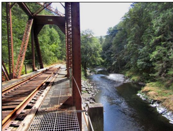
The Salmonberry River railroad trail northeast of Tillamook.

Bring your favorite potluck dish to share...along with your own plates, utensils and cups... and $1 to help cover club expenses