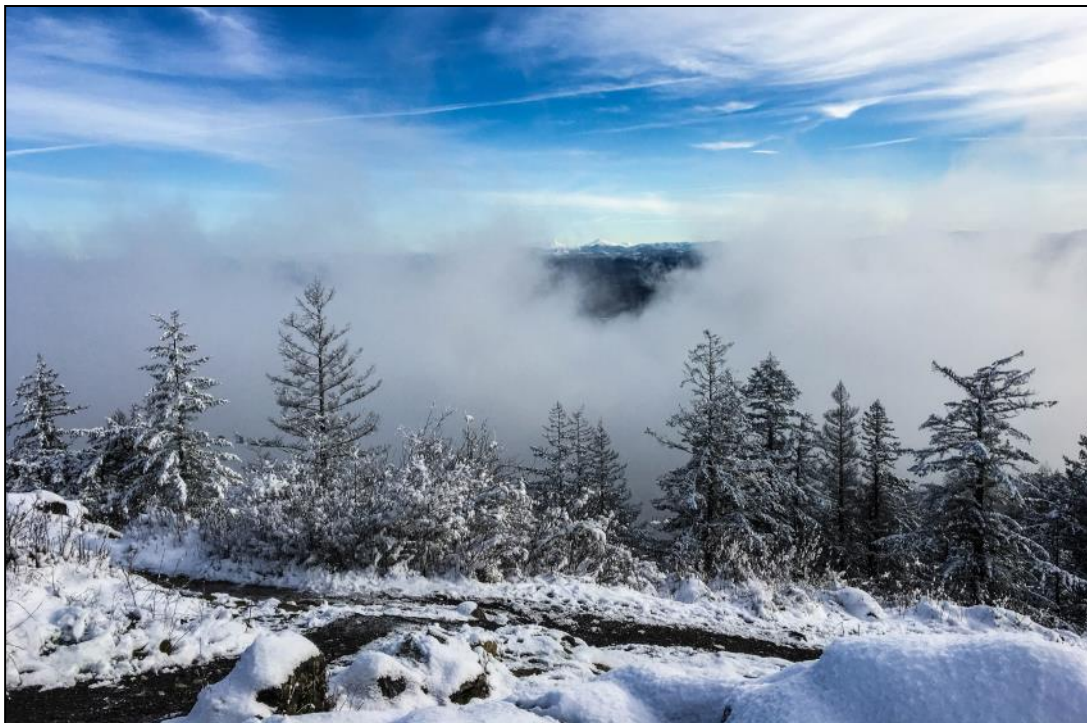
From the top of Spencer Butte December 7.