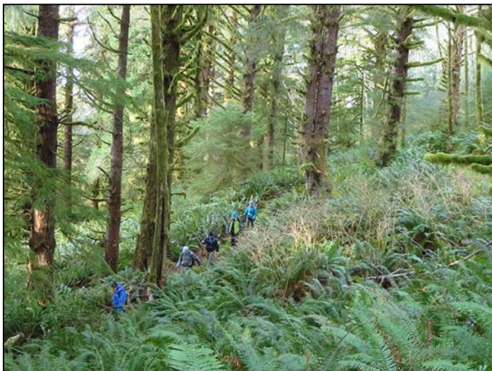
Hiking through a sea of green.