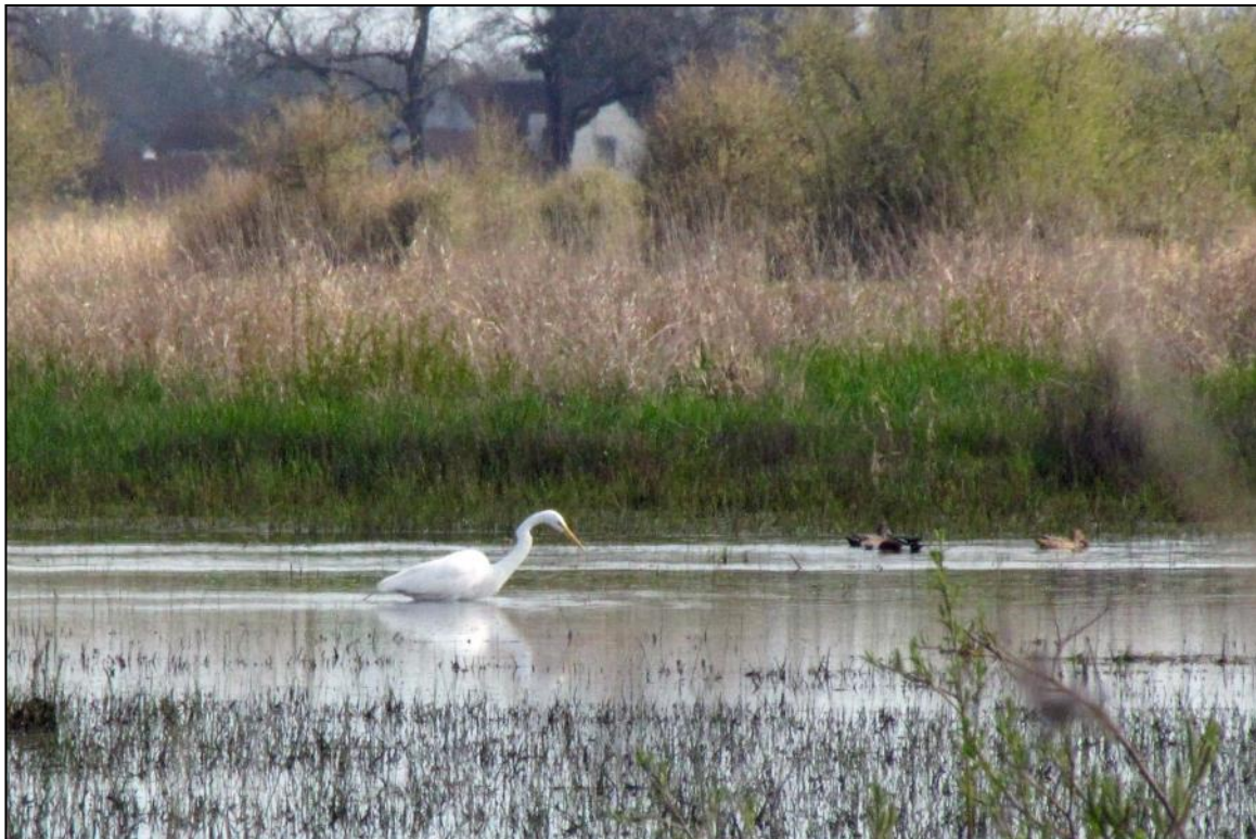
at Finley Wildlife Preserve—See trip report on page 9.

ENJOY the photos in color! ONLINE Bulletin at http://www.obsidians.org