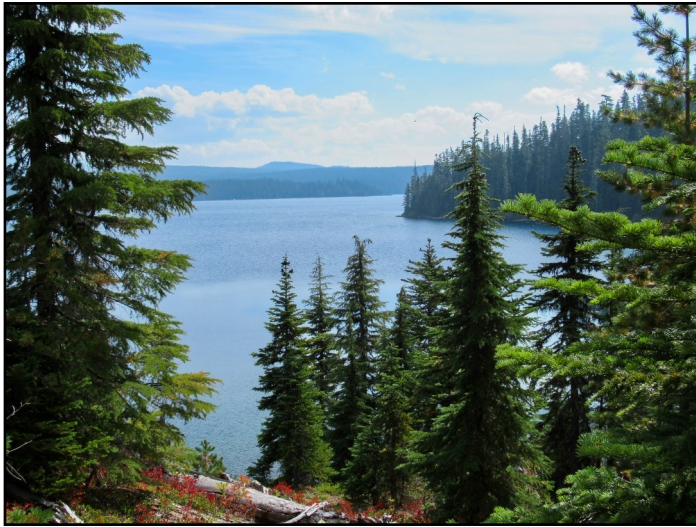
View from the west side of Waldo Lake.

WE HAD SIX PEOPLE ON A COLD (32 DEGREES AT NORTH WALDO CAMPGROUND) BUT SUNNY MORNING. We all hiked at the same pace, taking brief breaks at all trailheads (there were eight) and longer breaks (about 5–7 minutes) every hour. We worked our way across North Waldo, hiked the long stretch along the west shore, had lunch at South Waldo Shelter, and finally hiked the long stretch in the woods with no views of the lake back up to the starting point. We were on the trail before eight, and we finished about 3:15. Twenty miles—no more, no less—and everybody survived. It is remarkable to look at the whole lake at the end of the hike and tell yourself you have been around every single bit of it! Members: Marguerite Cooney, Michael Dunne, Lubos Hubata-Vacek, David Lodeesen, Lynn Meacham, Mike Smith.