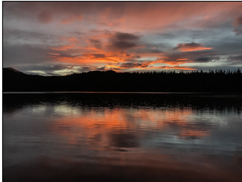
Sunset on Olallie Lake. See trip report on page 6.

ENJOY the photos in color! ONLINE Bulletin at www.obsidians.org