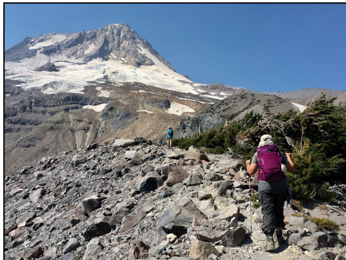
Lynn Meacham and Sue Wolling on Timberline Trail.

A CREW OF SEVEN OBSIDIANS CAMPED AT LOST CREEK CAMPGROUND and spent three days exploring the wonders of Mount Hood. Our first day's destination was McNeil Point on the north side of Hood (11 miles, 2,200 ft. gain). We chose the slightly longer route around Bald Mountain and were rewarded with an excellent viewpoint for a rest and our first sight of 11,000 ft. Mt. Hood. The trail then connected with the Timberline Trail. This section of trail passed a fine array of picturesque meadows and ponds before getting to the side trail that would lead us up a ridge to the stone shelter on McNeil Point. For our second day's adventure, we took the Elk Meadow trail to Gnarl Ridge (11 miles 2,500 ft. gain). Crossing over bridgeless Newton Creek was a challenge, but we all managed to walk, crawl, butt walk on the make-shift logs, or simply splash through the flowing creek. From there we hiked up to Timberline Trail just beyond Lamberson Butte where we emerged from the trees onto a vast cliff. There we saw water gushing out of glacier-covered Mt. Hood