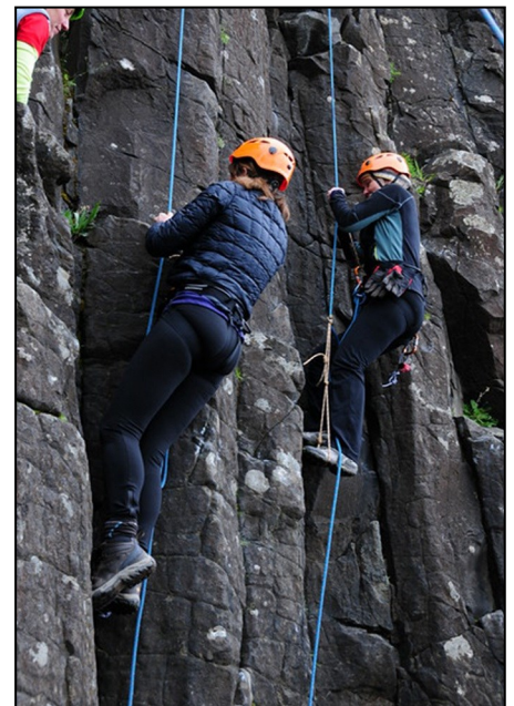
Ascending fixed line.

More information on the class is on the Climbs page of the Obsidians webpage. Registration opens at 7:00 AM on Feb. 16, 2019. One of the many benefits of being an Obsidian member is that you can pre-register for the class. To learn more contact climbs@obsidians.org .