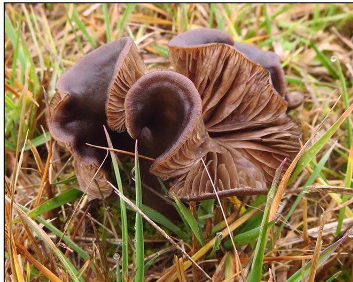
Beautiful field mushroom.