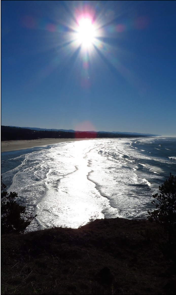
Looking back from where we came.

TODAY, ON THIS YEAR'S WARMEST (58°F) AND PRETTIEST DAY of the year, we hiked from the Yaquina Bay Lighthouse to the Yaquina Head Lighthouse. What a great hike it ended