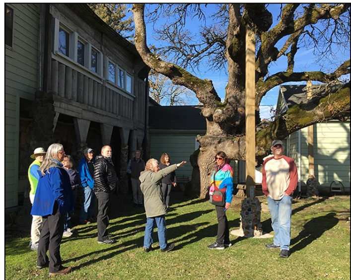
Living Rock Studio with the artist's daughter giving the tour.