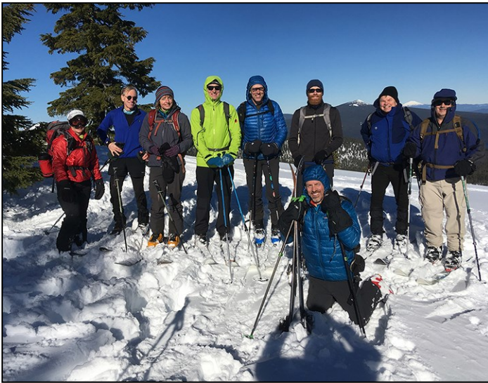
On top of Redtop!