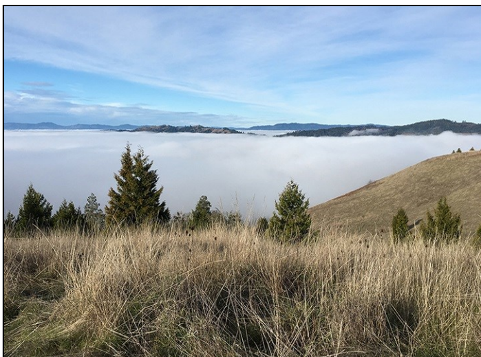
At last above the fog.