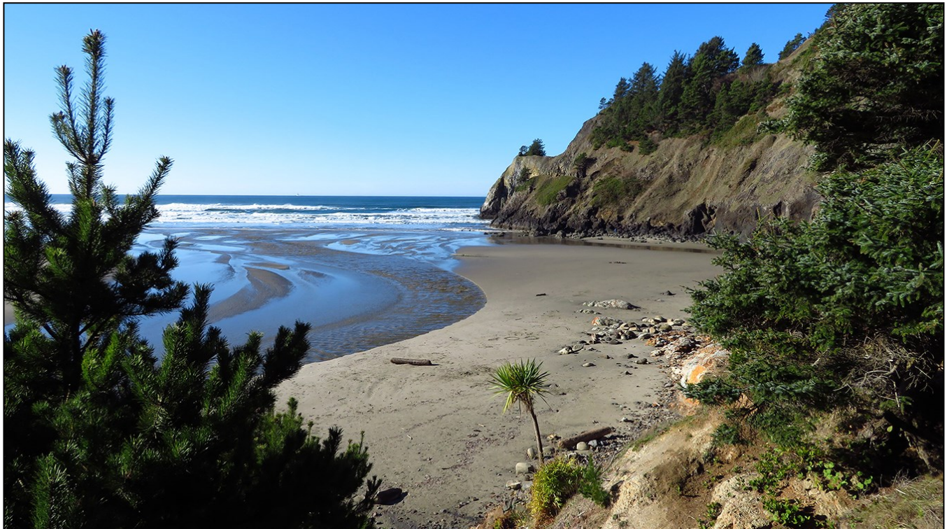
Little Creek turns the bend and enters the Pacific. See Yaquina Bay to Yaquina Head trip report on page 6.

ENJOY the photos in color! ONLINE Bulletin at www.obsidians.org