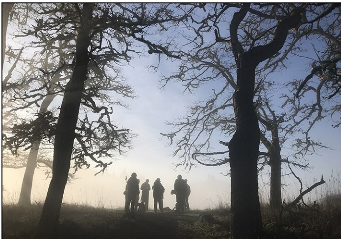
Waiting at a foggy junction.