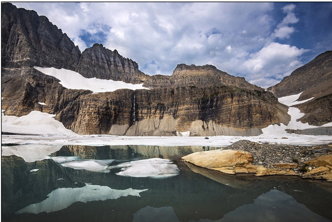
Grinnell Glacier Basin NPS Photo Gallery

Bring your favorite potluck dish to share...along with your own plates, utensils and cups... and $1 to help cover club expenses.