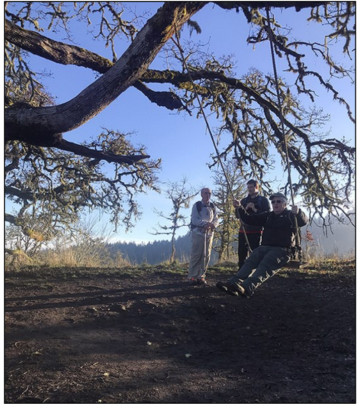
Brad shows us his pumping skills.

THE HIKES BY DATE WERE: January 12 Pisgah Gander-flanking by number: 9 Members, 2 Nonmembers. January 19 Sunset/Moonrise: 10 Members, 2 Nonmembers. January 27: 5 Members, 3 Nonmembers.