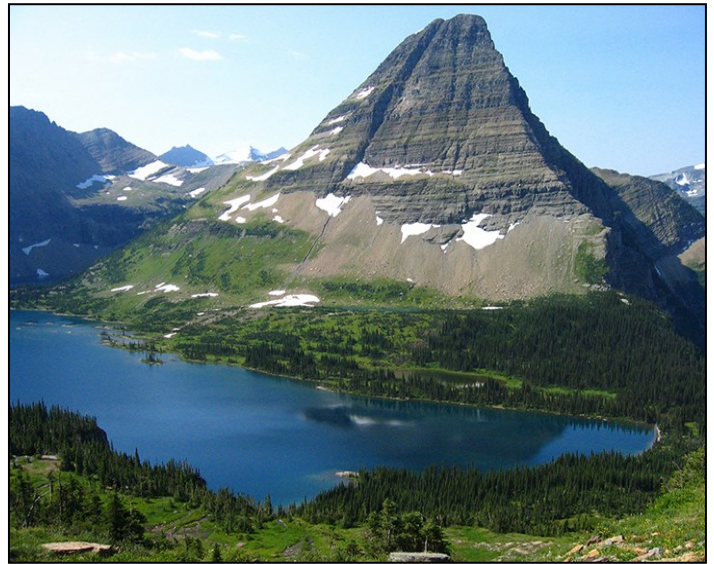
Hidden Lake from Going-to-the-Sun Road NPS Photo Gallery

WE ARE GOING TO GLACIER NATIONAL PARK SEPTEMBER 1-7! If you think you may be interested in this adventure, be sure to attend this program. We will discuss the registration process, camp logistics, and show slides of some of the amazing hikes. Additional information is available on our website.