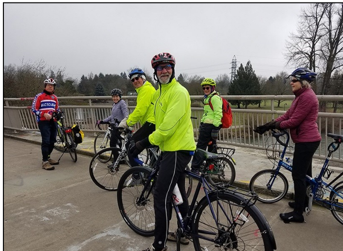
Where's Waldo at the Defazio Bridge

COLD AND FOGGY WAS THE ORDER OF THE DAY as the ten rode into the abyss. We navigated the Willamette River via many bridges as we all told stories of the past. Today was a