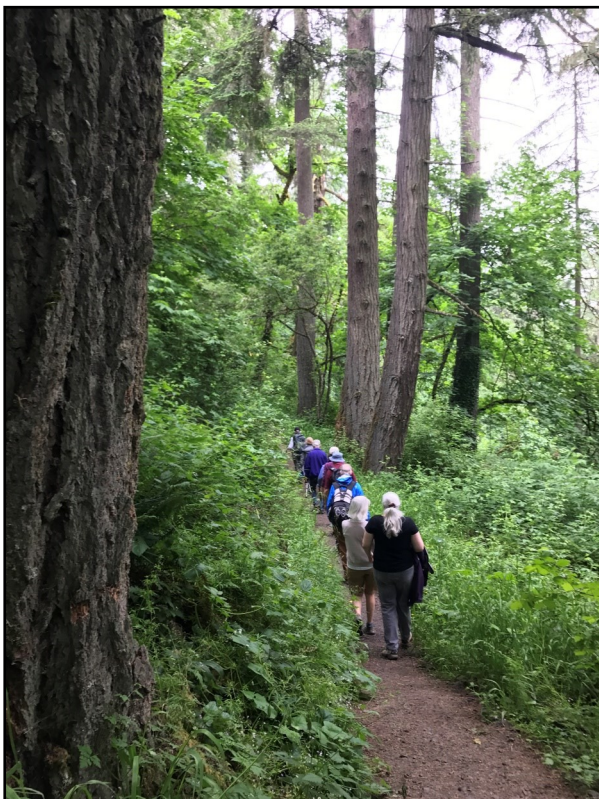
Get Acquainted Hike, June 2017