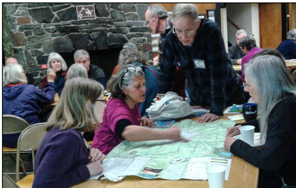
Planning at the 2018 Summer Trips Rally.