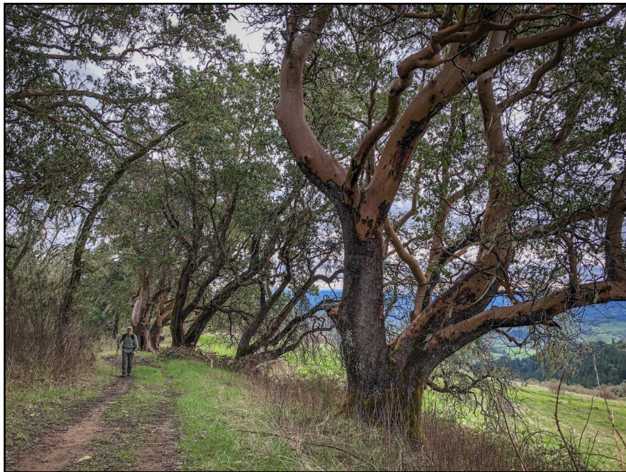
Giant madrones at North Bank. See trip report on page 7.

ENJOY the photos in color! ONLINE Bulletin at www.observians.org