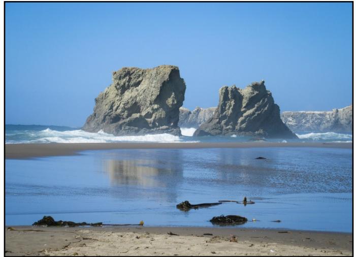
Bandon Beach