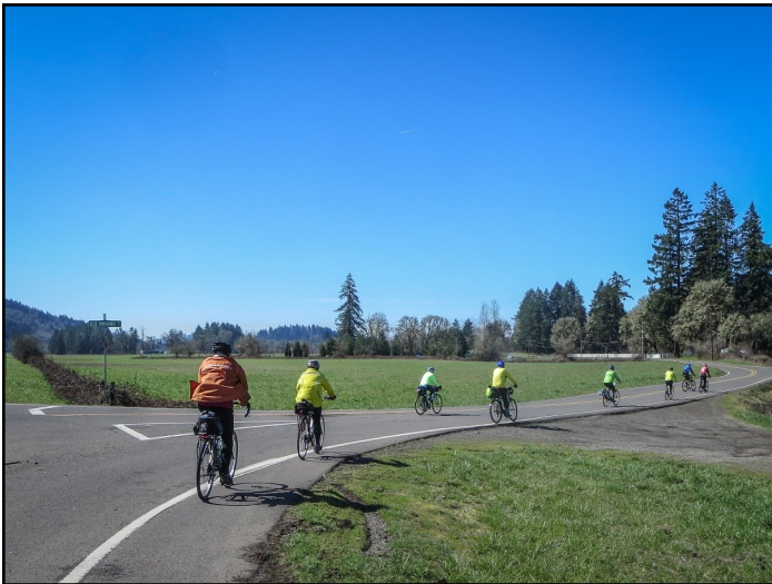
Beautiful day on Old Mohawk Road.