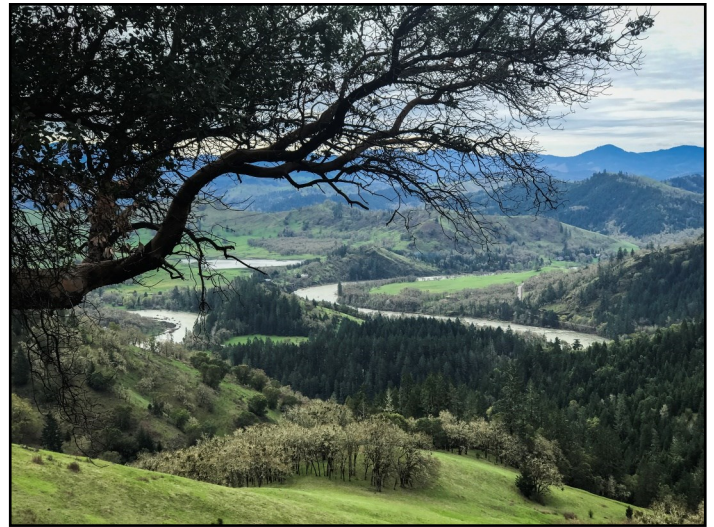
Horseshoe Bend on the North Umpqua River.

THE LOOP HIKE AROUND THE ROLLING BOUNDARY RIDGE overlooks the North Fork of the Umpqua River. It was the 27 th Obsidian North Bank hike since 1999. What was new for this early April hike? The recent snow damaged many trees. We weaved our way around and under fallen trees and branches hoping to avoid poison oak. The trail was much drier than we expected. Two chocolate lilies and blankets of baby blue eyes were the star attractions on the way up to the ridge. A repeating bird call was identified as a northern pygmy-owl thanks to a phone call to Randy Sinnott who politely listened to our imitations. Marguerite led a short detour on the Thistle Trail to see the spectacular grove of madrone trees.