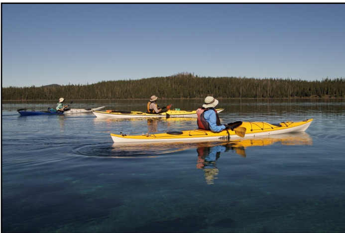
Morning on the water.

S EVEN KAYAKS AND A CANOE TOOK PART in this year's Waldo Lake flotilla, with nine paddlers propelling them through three days of the most placid water I've ever seen on the lake. Anticipating crowds of COVID-19 refugees, we were concerned this year about finding a campsite to accommodate a large group; however, as luck would have it, our first choice of unimproved sites was available in a lovely cove with a lengthy sand beach near Rhododendron Island. The weather was in our favor, as in daytime highs in the eighties and nighttime lows around fifty degrees Fahrenheit—a comfortable range for the High Cascades in September. After establishing camp, parties dispersed to paddle or hike, always observing safety practices such as not going alone. Huckleberries were ripe and were incorporated into several breakfasts. Instead of moving camp as in years past, we chose to remain another night at our site. Coasting the shoreline, it was evident that most of the best and largest campsites on the western shore were occupied.