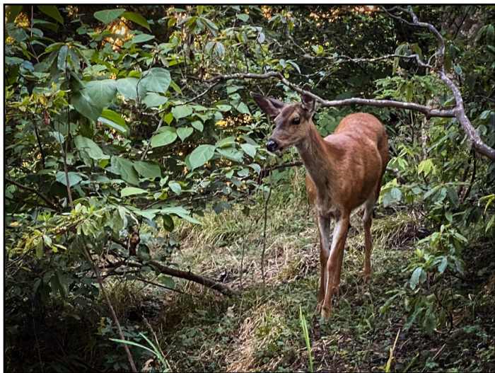
Another visitor enjoying Hendricks Park.