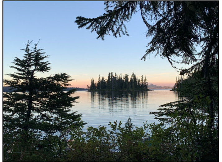
Sunset from our cabin