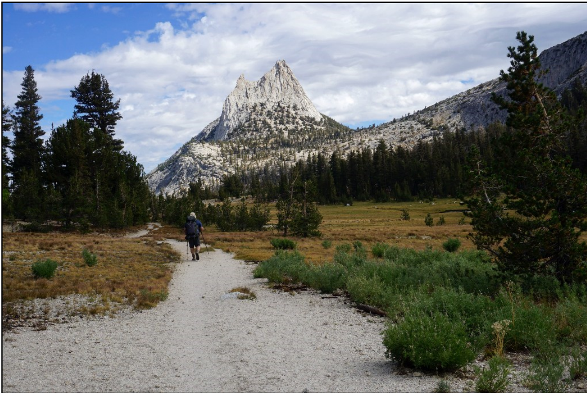
Cathedral Peak in Yosemite National Park - (See trip report on page 11.)

ENJOY the photos in color! ONLINE Bulletin at www.obsidians.org