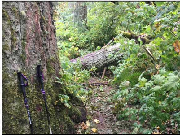
Before and after photos of the most recent tree removal from the trail on Spencer Butte.