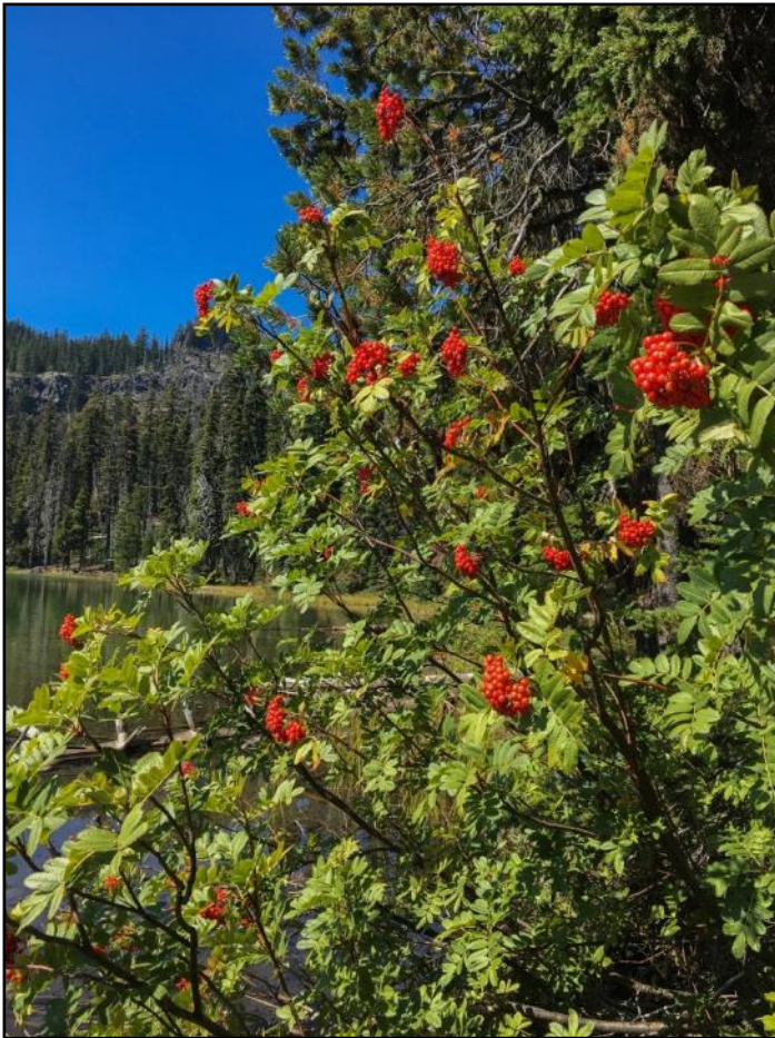
The mountain ash was stunning!