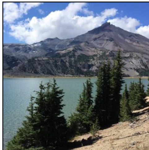
Green Lake and the South Sister.