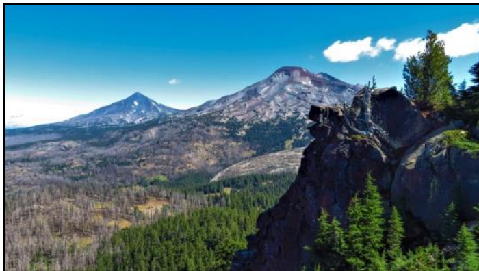
Middle and South Sister.