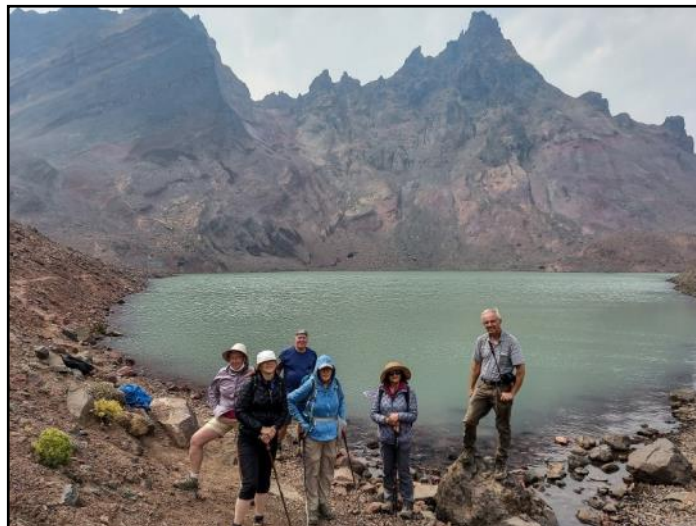
No Name Lake and Broken Top.