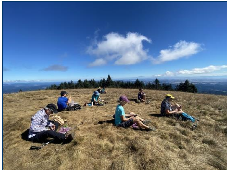
Socially distanced lunch on Marys Peak. See the Marys Peak trip report on p. 14.

ENJOY the photos in color! ONLINE Bulletin at www.obsidians.org