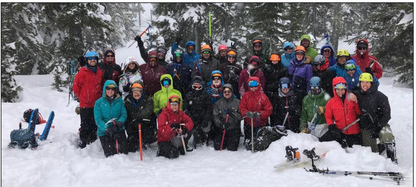
Snow Skills Day: the class and volunteers at Hayrick Butte.