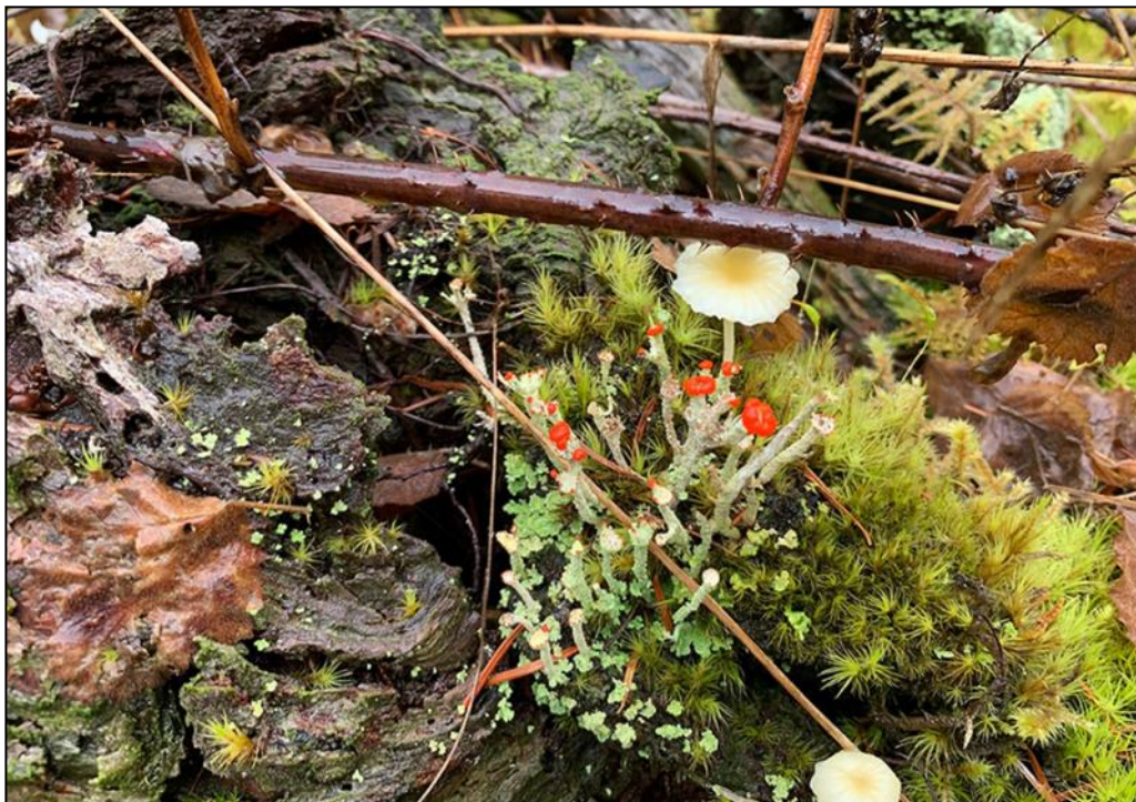
Red pixie-cup lichen. See Salmon Creek Mother's Day Hike trip report on page 8.

ENJOY the photos in color! ONLINE Bulletin at www.observians.org