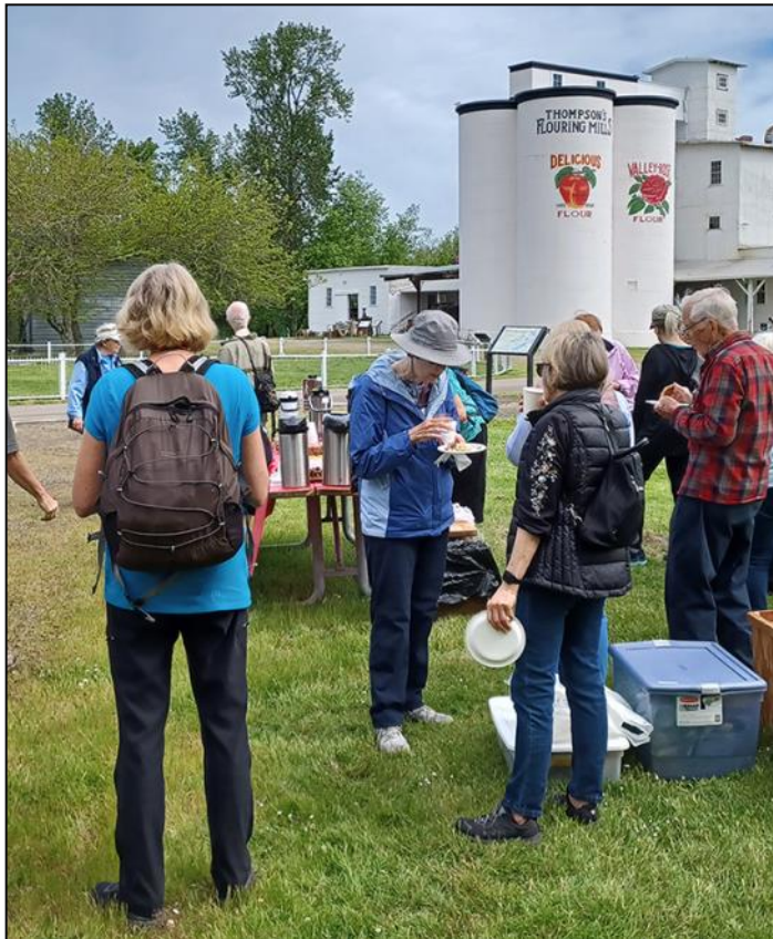
Snack break near the silos at Thompson's Mills.

R ANGER RYE (LIKE THE BREAD) AND RANGER TOM GREETED 29 OBSIDIANS AND GUESTS AT THOMPSON'S MILLS STATE HERITAGE SITE outside of Shedd, Oregon. After touring the only remaining water-powered mill in Oregon,