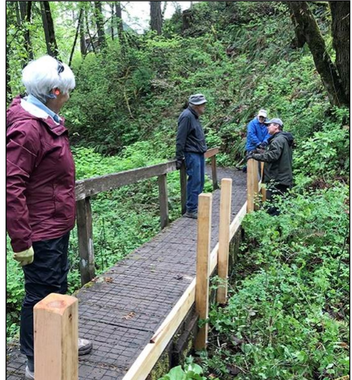
All the posts are in place on this section.