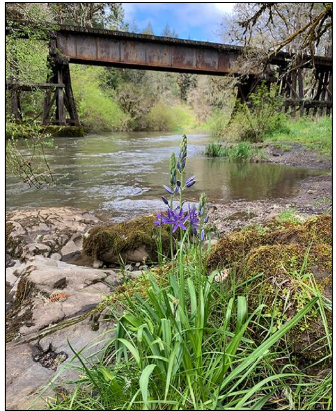
Camas and railroad bridge over Marys River.

EIGHT OBSIDIANS AND SIX GUESTS MADE THEIR WAY TO FITTON GREEN NATURAL AREA outside of Corvallis. This area is adjoined by the Crestmont and Bald Hill Farm land trusts,