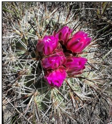
Hedgehog cactus blooming.