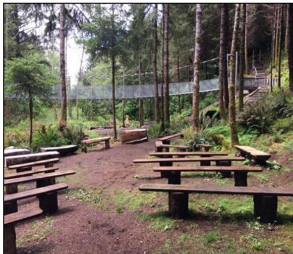
Amanda Gathering Area. The bridge is visible in the background.