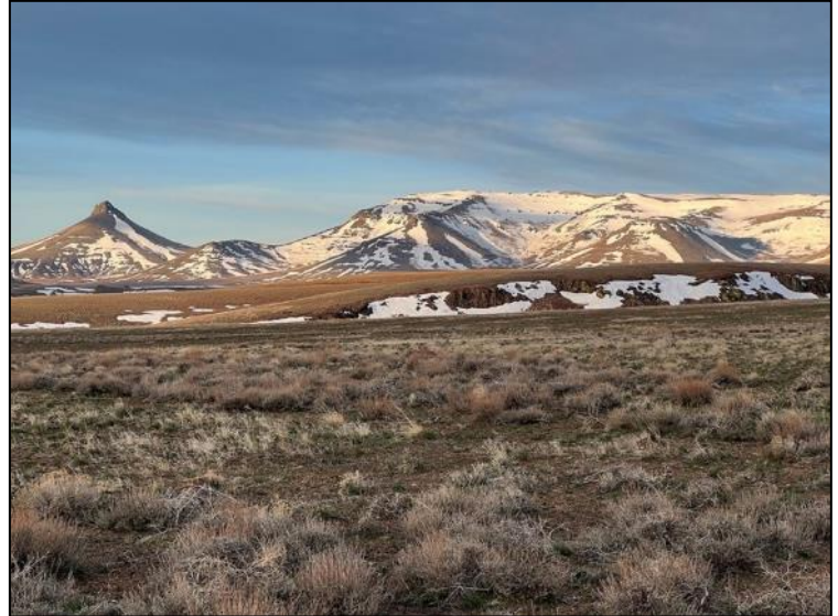
North end of the caldera on the Oregon side and the Trout Creek Mountains