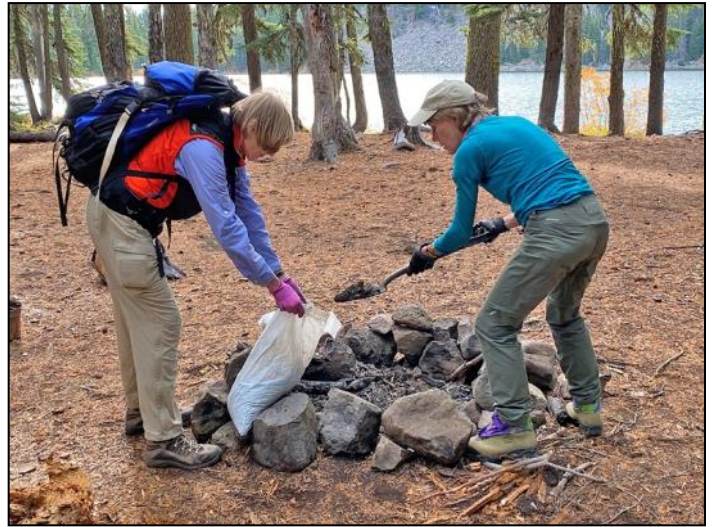
Cleaning out the fire rings at Rosary Lakes.