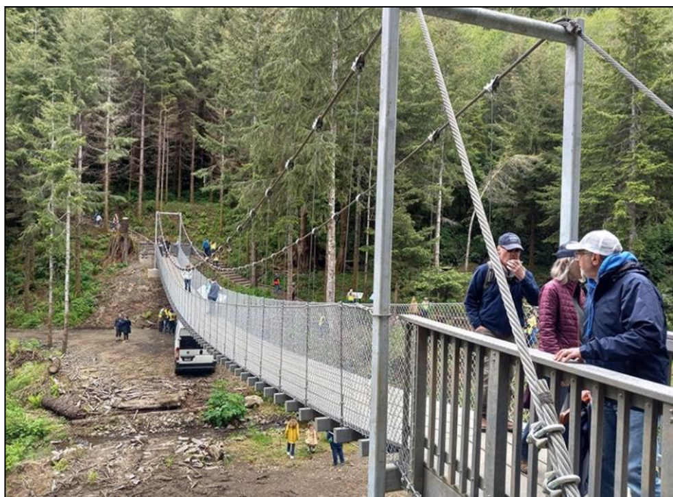
The new suspension bridge.

The Amanda Bridge now connects the two sides of the Amanda Trail, which is a section of the Oregon Coast Trail, and emerged as a lasting symbol that day. So many people—sponsors and supporters; volunteers and citizens; Coos, Lower Umpqua, Siuslaw, and Alsea People; and US and state government employees—worked together for this moment to happen. They had come not only to commemorate the lost lives and the brutality perpetuated on the march and at the Alsea sub-agency prison camp (1859–1875), but also to acknowledge, honor, and strengthen their connections forged through this project.