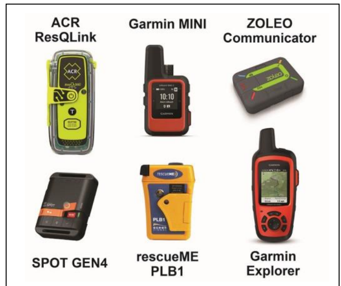
An assortment of personal beacons.

ZOLEO Communicator: www.zoleo.com/en-us/satellite-communicator