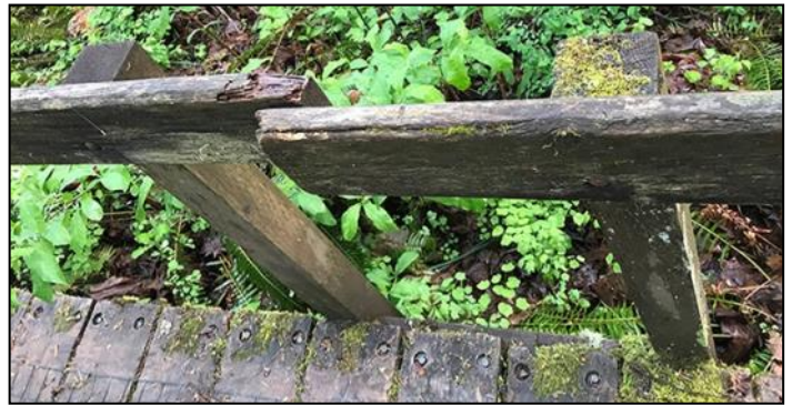
A portion of the rail showing a rotten section.