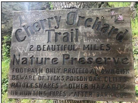
Charming old sign.

T HREE OF US MADE THIS HIKE ON THE WASHINGTON SIDE OF THE COLUMBIA RIVER GORGE. We were on the trail at 10:20 AM. After about a quarter of a mile, we broke out into