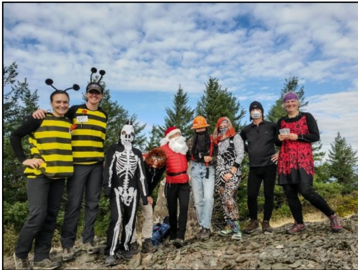
Crazy costume crew.