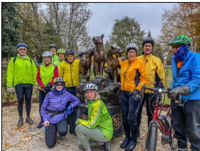
At the Women in Combat Memorial.