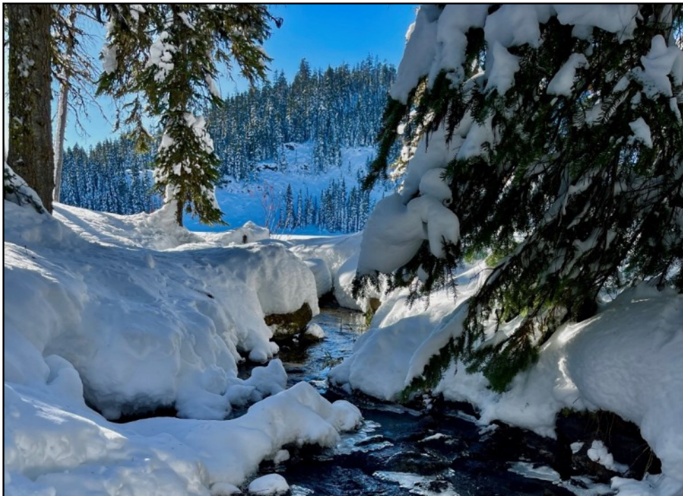
See the Rosary Lakes Snowshoe trip report on page 12.

ENJOY the photos in color! ONLINE Bulletin at www.obsidians.org