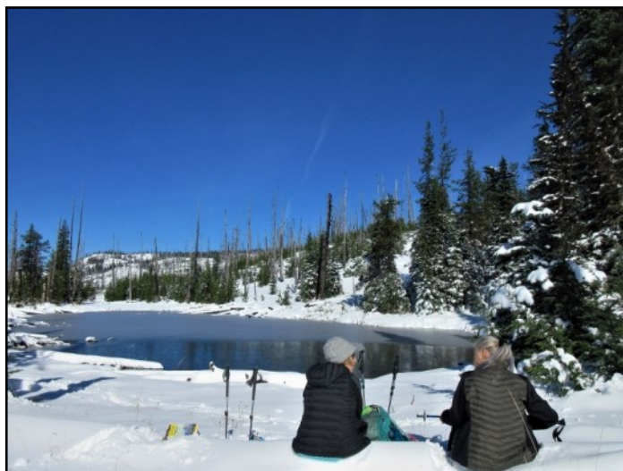
Monica and Kathie at lunch.

CONDITIONS CHANGE QUICKLY IN THE MOUNTAINS. After months of record-breaking heat, drought, and smoke, a wet cold front moved in two days before our hike. We planned for a two-lake hike with autumn foliage and ended up hiking in a half-foot of snow. Fortunately, the sky was clear and blue, the temperature mild, and several hunters and hikers had already broken the trail, making it quite easy for us to hike in our boots. We didn't make it to the Berley Lakes, but we had a simply wonderful day snow-hiking along the PCT and Santiam Lake trail; enjoying views of Three Fingered Jack, Mt. Washington, North and Middle Sisters, and Broken Top, all blanketed in first-of-the-season snow. Special thanks to the adventuresome Obsidian participants who were willing to go with the flow for a great day on the trail. Members: Kathie Carpenter, Daphne James, Monica Ozwoeld.