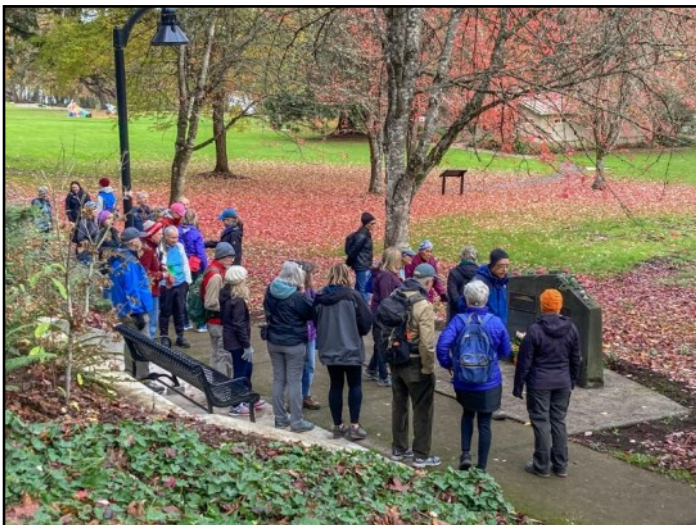
At the traveling Vietnam War Memorial Wall.