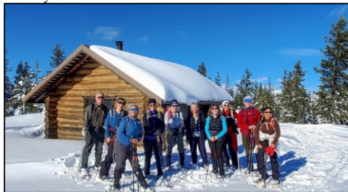
At the Brandenburg Shelter.