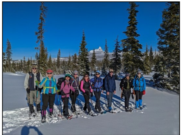
Snowshoers with Three Fingred Jack in the background.

AFTER WAITING WEEKS FOR THE WEATHER TO CLEAR ENOUGH TO GO SNOWSHOEING, we finally got a chance on January 20th. We left the fog in Eugene to head up to Ray Benson Sno-Park, where we were greeted by a sunny and eventually warm day. With six inches of powder, the snow conditions were perfect. We took the North Loop trail to North Blowout Shelter and, as it was so nice, we continued on past Circle Lake to Island Junction Shelter where we had our lunch and enjoyed the sunshine. We took the fire road back to our vehicles and made a stop at Takoda's for dinner on the way home. Members: Marguerite Cooney, Lorraine Cuevas, Robert Eriksen, Steven Johnson, Holger Krentz, Jane Leng, Lynn Meacham, Michael Myers, Angie Ruzicka, Signe Wright.