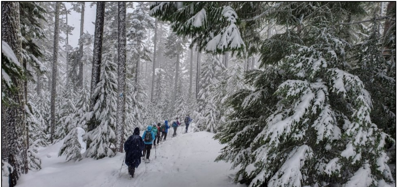
See the Odell Overlook trip report on page 7.

ENJOY the photos in color! ONLINE Bulletin at www.obsidians.org