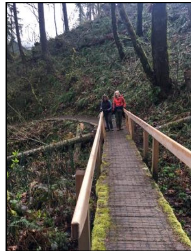
Damaged during the storm, the cedar handrails on the bridge below the Raptor Center have been repaired. Obsidians installed new handrails back in April and May 2022.