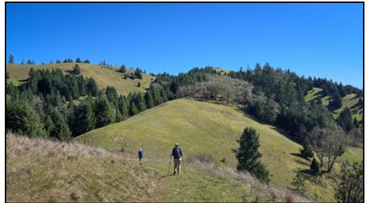
A sunny March day to enjoy the North Bank Habitat Management Area.

THE WRINKLED HILLS OF THE NORTH BANK HABITAT MANAGEMENT AREA never disappoint. We started our cold morning hike by wading through the mud on the swampy Chasm Creek Road, then continued up the steep climb to the North Boundary Road, and arrived at the sunny summit of Round Timber around noon. After lunch with a great view, we continued clockwise via the Ridge Trail and the Middle Ridge Trail all the way to the West Entrance Day Use parking lot, which was packed with cars baking in the hot mid-March sun. Members: Holger Krentz, Angie Ruzicka, Darko Sojak.