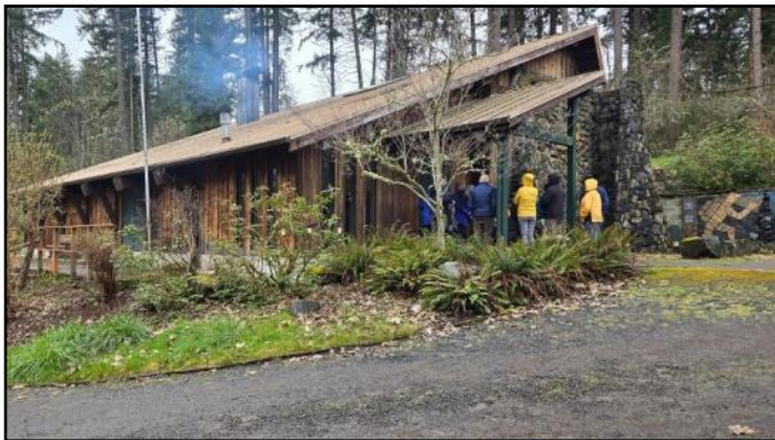
Guests and members gather for Get Acquainted Hike.