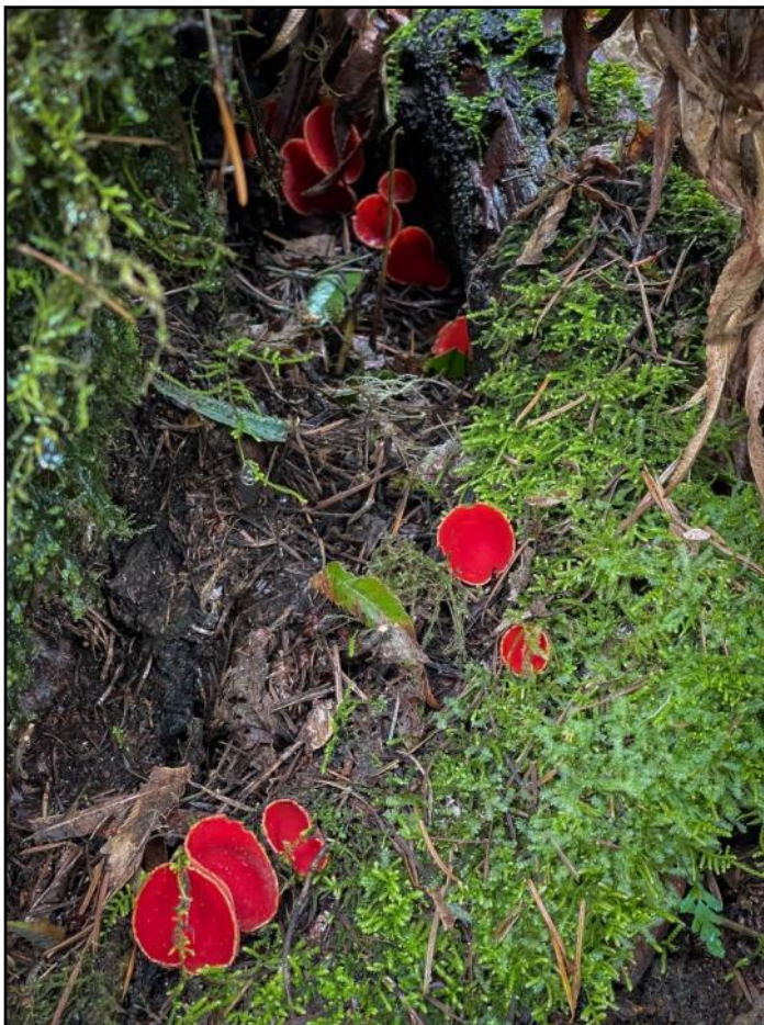
A string of scarlet elf cup found along the Ridgeline Trail.