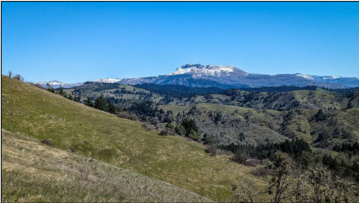
Snow on the mountains all around. See the North Bank Habitat Management Area trip report on page 8.

ENJOY the photos in color! ONLINE Bulletin at www.obsidians.org