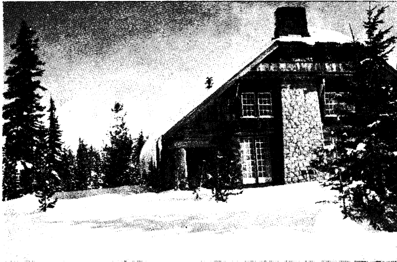
Mazama Lodge with the beautiful Mt. Hood in background.