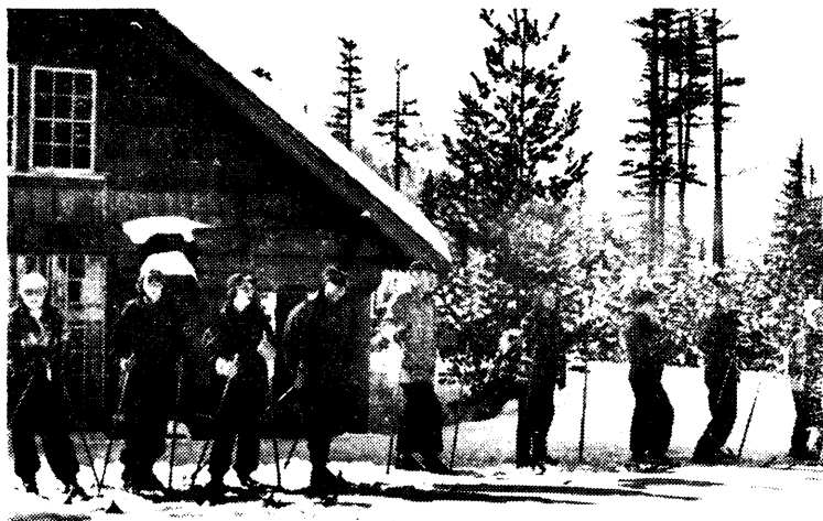
Obsidians on a previous Winter Outing to Mazama Lodge—1938

The outing will cost $22.00 a week or $3.50 a day for members and $25.00 a week or $4.00 a day for non-members. This fee covers lodging