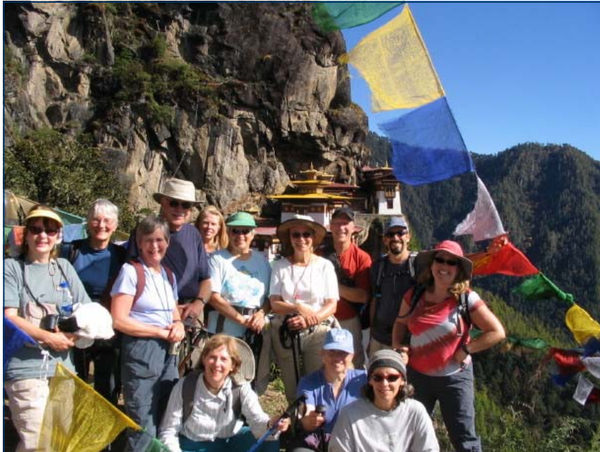
Our group with prayer flags flying and "Tiger's Nest" temple in background. Perched on a cliff 2,000 feet over the valley, the temple got its name from the legend that the Guru Rinpoche flew across the mountains to this spot on the back of a tigress.

We'd invited Luke to join us for a special hike planned by Sonam in central Bhutan (near Wangdi), so we all headed for Thimphu after dinner and then further east the next morning.