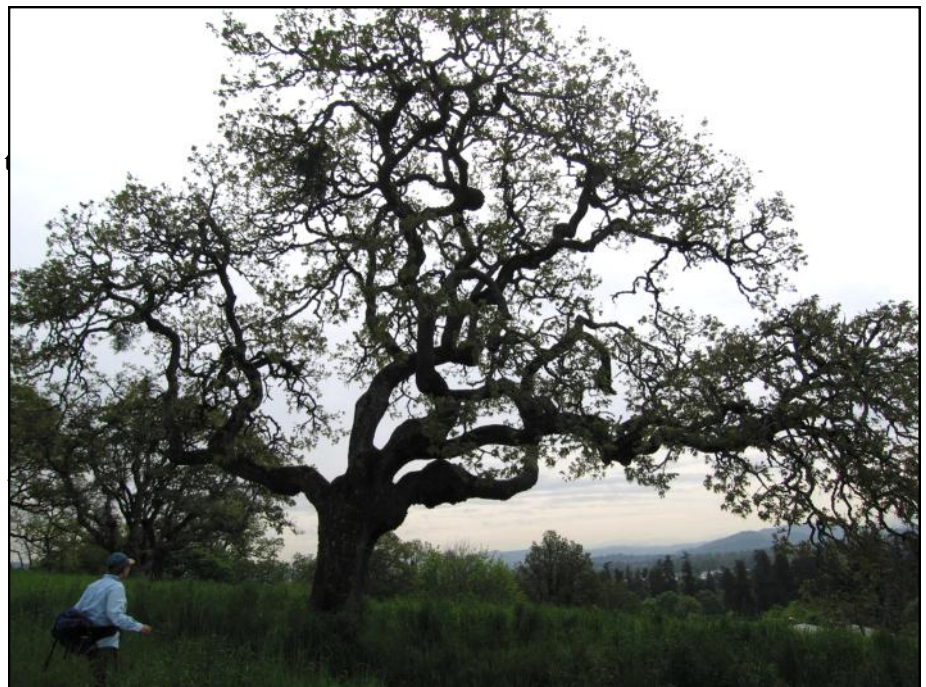
Legacy white oak near top of Gillespie Butte.