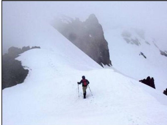
Climb School graduation climb of Diamond Peak.

The rock field session took place on a Saturday and Sunday with half of the students attending each day. The students performed on the vertical rock