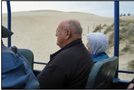
Bussers Busy Buggying

T WENTY-TWO RIDERS and one bus driver left Eugene via back roads around Fern Ridge Lake and spillway to the small community of Franklin, joining Hwy 36 just west of Cheshire. We stopped for a coffee break at the lovely creek and wooded area of Alderwood, where we observed plenty of wild dogwood trees and many wild flowers dotting the trail along the creek. A refreshing walk along the creek was enjoyed by several riders. Hwy 36 to Mapleton was a memory for some - it was the only way to Florence from Eugene for many years - but it is a new highway for some newcomers to our area. Florence Old Town and waterfront along the Siuslaw River offered many shops and a great walk past old restored buildings, and new ones being built, to the Siuslaw Historical Museum. Being in Florence just three days before the continuing celebration of the 100th year anniversary of the Rhododendron Festival let us in on the best of color, and the town was decked out for the festive weekend coming up. Rhododendron Drive along the Siuslaw River to Harbor Vista displayed new spring-fresh rhodies, both wild and cultured. At the end of this beautiful drive, we dined for lunch at Driftwood Shores which has a wonderful ocean view from the upstairs banquet room. A birthday party for those with birthdays in the month of May, Ewart Baldwin and Paula Beard (two days apart), was celebrated in the traditional style with cake, ice cream,