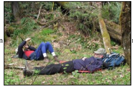
Lazing along the McKenzie River Trail

WE WENT AHEAD WITH PLAN "C" when we learned that 3-4 feet of snow still remain at Clear Lake and that, although the snow was scant from Trail-bridge on down river, the trail crews had only cleared the lower trail up to Deer Creek. Our trip began at Belknap Springs Resort and took the river-hugging trail up river where many of us