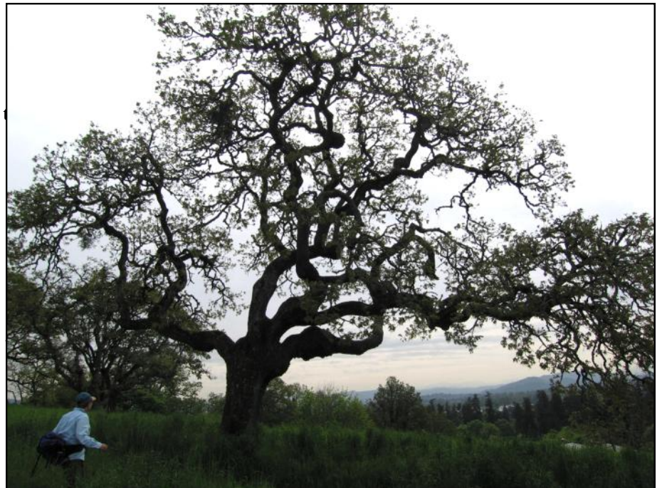
Legacy white oak near top of Gillespie Butte.