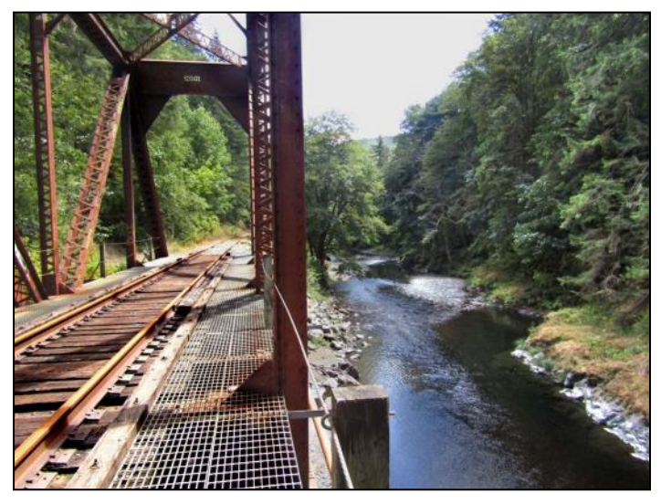
The Salmonberry River railroad trail northeast of Tillamook.

Bring your favorite potluck dish to share...along with your own plates, utensils and cups... and $1 to help cover club expenses