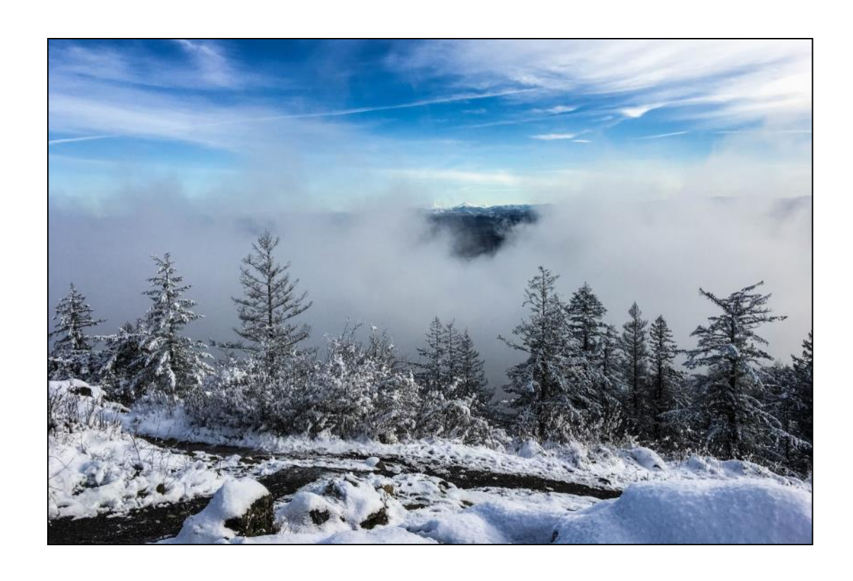
From the top of Spencer Butte December 7.