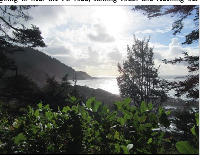
Ocean view from the Pacific Coast Trail.

BEFORE HIKING COOKS RIDGE, we met Rachelle from Yachats and took the group picture at the trailhead. The trail climbs about 1,000' to the Gwynn Creek junction. We kept going to near the FS road, turning south and reaching our