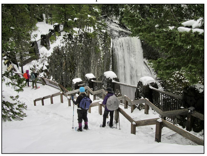
The Obsidians at Salt Creek Falls.

Creek Falls Loop Trail. The previous day brought about a foot of fresh snow on top of a nearly missing base layer. We started out with a temperature of 34 degrees with a misty light rain falling. Salt Creek Falls were as magnificent as ever as the falling mist turned into real rain. On we trudged, wishing the temperature would drop a few degrees and turn this wet mess into a mini blizzard—YES! But not to be—bummer. The snow along the trail was still pretty good for snowshoeing, being anywhere from a few inches to over a foot in many planes. With little to no base snow, we had several blowdowns and deadfalls to climb over or go around. The wetness must have kept others off the trail or at home as we only came across two other snowshoers. We stopped at an overlook above Diamond Creek Falls to scarf down a quick lunch and marched on back