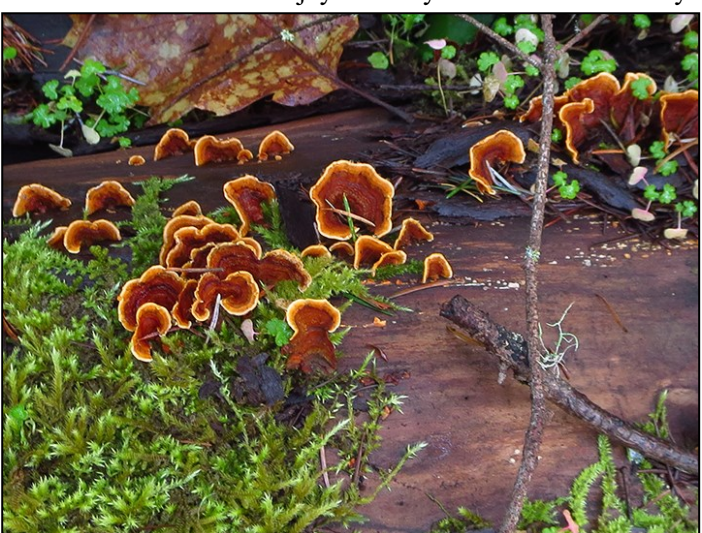
Red bracket mushrooms on the log.

As George Washington Carver wrote, "Nothing is more beautiful than the loveliness of the woods before sunrise." Three of us enjoyed today's sunrise immensely.