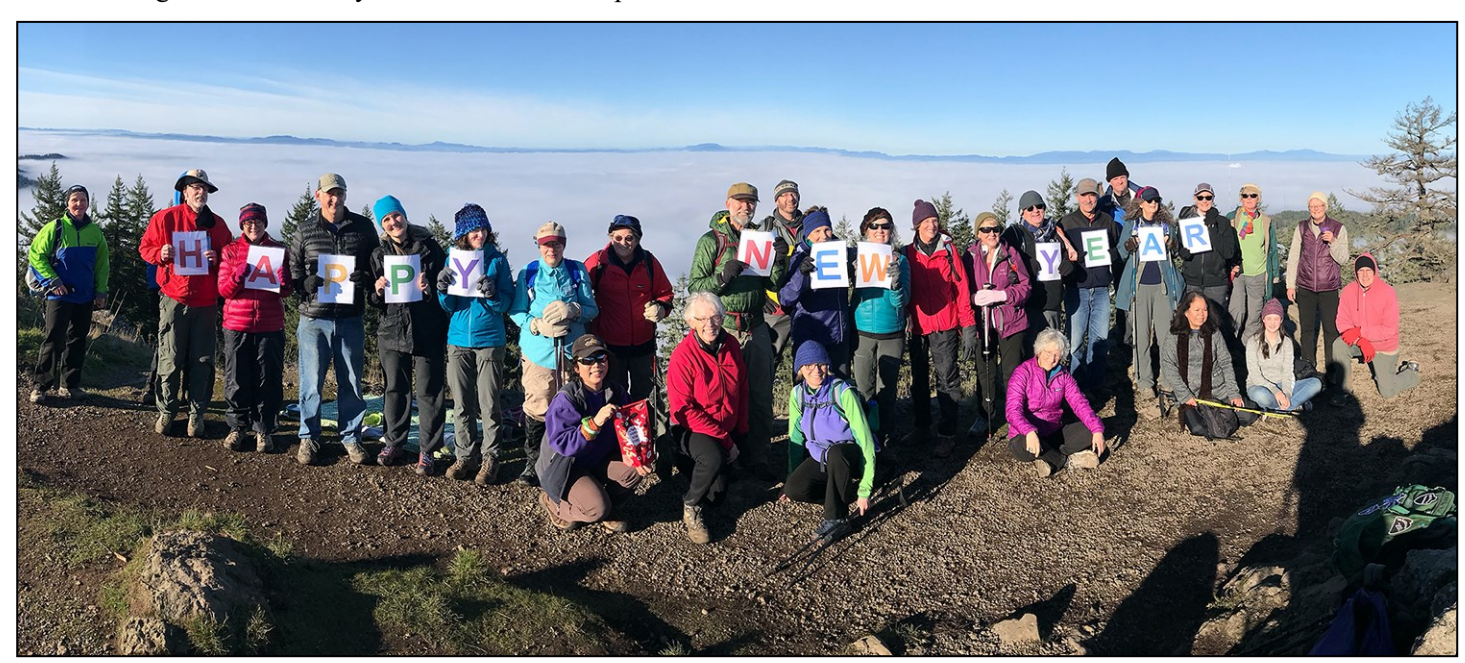
Two groups of hikers met above the fog for another Obsidian New Year! See trip reports.

NINETEEN OF US MET AT 9:30 at the cold and cloudy Spencer Butte parking lot for our 6<sup>th</sup> annual New Year hike. We toasted to New Experiences in 2018 with pomegranate Italian