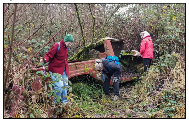
Dorothy, Kathie, and Angie explore the old truck.

SHORT HIKE WITH PLENTY OF EXCITEMENT AND SURPRISES. From the northernmost street of the Eugene city limits, we meandered bushy, overgrown, slippery and somewhat muddy trails north almost to the Wilson Bend. In the blackberry jungle between the ponds and rushing Willamette River, we discovered an old rusty truck and a mysterious wooden structure. Along the river, we saw big frogs, chirping small birds, and one bald eagle. On the way back, we enjoyed river otters, huge jumping fish, close-by beaver in the pond along the trail, and a gang of wild turkeys roosting high in the branches of big leaf maple trees. Everyone enjoyed our crepuscular hike. Members: Kathie Carpenter, Angie Ruzicka, Darko Sojak, Dorothy van Winkle.