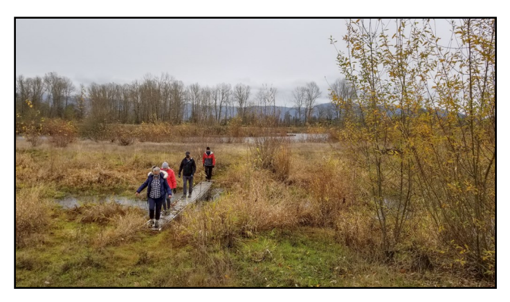
Crossing the bridge to the little pond.

DESPITE STORMY WEATHER PREDICTIONS, 13 of us ambled our way for several hours about this lush riparian property with little to no rain-and next to no signage to guide or educate us! McKenzie River Trust's Green Island is open to the public only a few days a year. We appreciated the one staff/ volunteer at the gate who suggested that we take a photo of the map board and stay on the graveled paths. There would be no further guidance for the day. Thinking we couldn't get too lost and slightly reassured that volunteers would be out looking for stragglers (a.k.a. lost hikers) at the 3:00 closing, we split into two groups and crossed paths only once late in the day. Phones recorded our efforts at 5.8 to 8 miles. Why an island you ask? Go yourself to see if you can learn the answer to that question. Wildlife reported: one large bounding deer, a pair of red-tail hawks, a few LBJ birds (little brown jobs), a ton of scat-likely from well-fed coyotes and maybe some berry-loving bears-and one beautiful turkey feather. (Editor's note: For information about future events at Green Island, check the website at mckenzieriver.org/property/green -island/). Members: Mari Baldwin, Patricia Cleall, Kathie Carpenter, Lynda Christiansen, Elizabeth Grant, Nancy Hoecker, Lou Maenz, Wally Miller, Michael Myers, Angie Ruzicka, Darko Sojak, Karen Yoerger. Nonmembers: Jerry Pergamit.