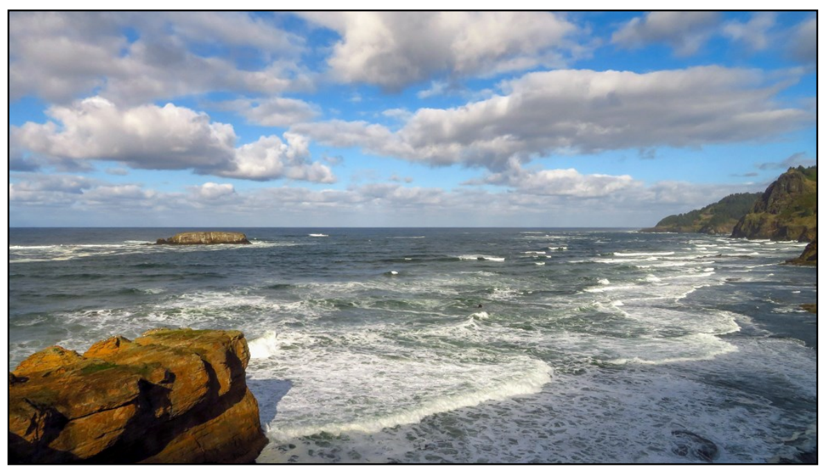
Looking north with Otter Rock on the left. (See report for Moolack Creek on page 7.)

ENJOY the photos in color! ONLINE Bulletin at www.obsidians.org