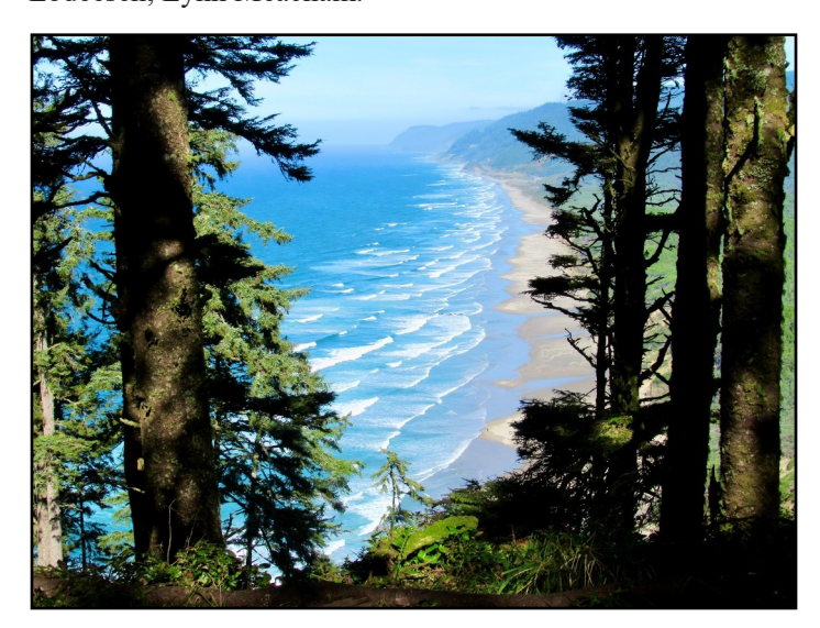
A favorite view for Obsidians.