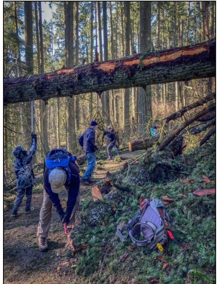
Lots of hard work.

trail to clear an outflow that we'd missed the Saturday before, then returned to the group. Everyone raked or pitched storm debris from the trail, drainage ditches, and drainage outflows. We were impressed that a couple of the trees managed to land perfectly in the outflows. For obvious reasons, we were unable to clear those. We made great time working our way back to the Tie Trail junction in time for treats supplied by Janet. We took about the last half hour lightly clearing the Main Trail on our way back to the trailhead for juice and cookies. We were greatly amused by the youthful exuberance of the Bell boys as they retrieved a cup casually discarded in a very steep location. Members: Matt Bell, Nathaniel Bell, Buzz Blumm, Steve Davis, Larry Dunlap, Janet Jacobsen, Denise Rubenstein, Sandra Sigrist, Lisa Van Liefde, Karen Yoerger. Nonmembers: Fletcher Bell.