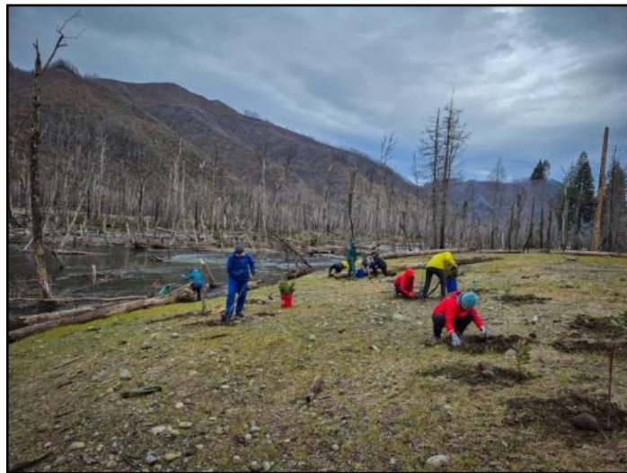
Planting bare root trees.