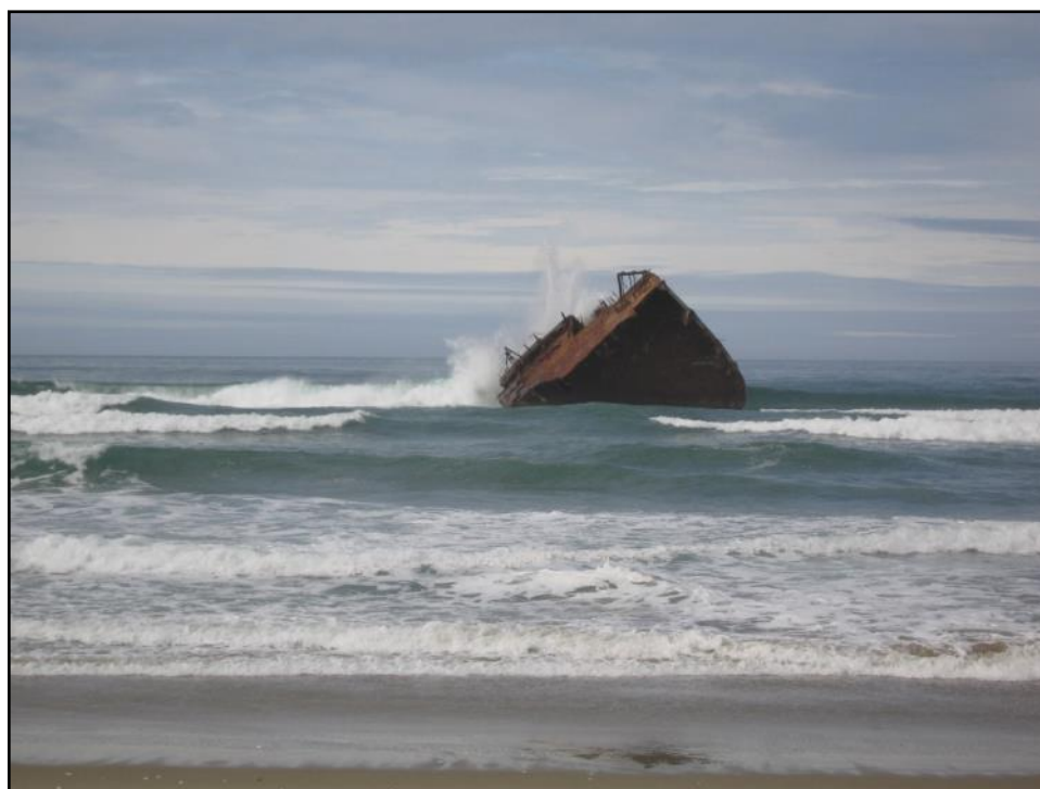
The stern of the New Carissa.