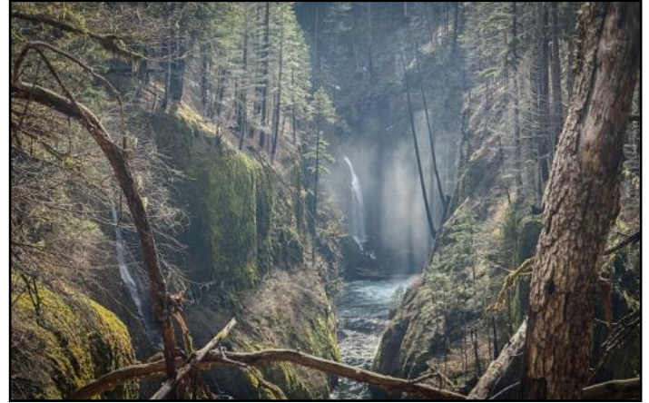
One of the waterfalls along the route.