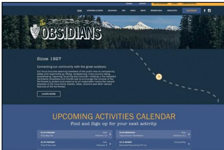
Sneak peek at the new website.

We recognize that this changeover will be very challenging. However, there will be many aspects which will be easier and which will better serve the needs of our membership. By the time of our next renewal period, members will be able to renew and pay online. Members will also have the option to sign up for notifications about upcoming hikes, climbs, overnights, and more. Finally, we look forward to better engaging the community about the Obsidians so we can continue to grow and thrive.