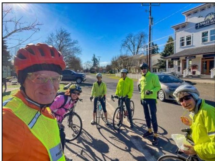
At Norma Pfeiffer Park, Coburg.