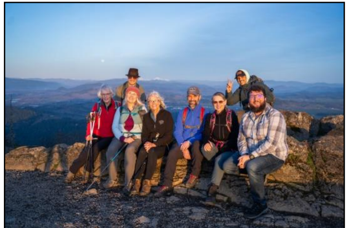
Watching the sunset on top of Spencer Butte after seeing the moon rise. Another hiker took the photo.