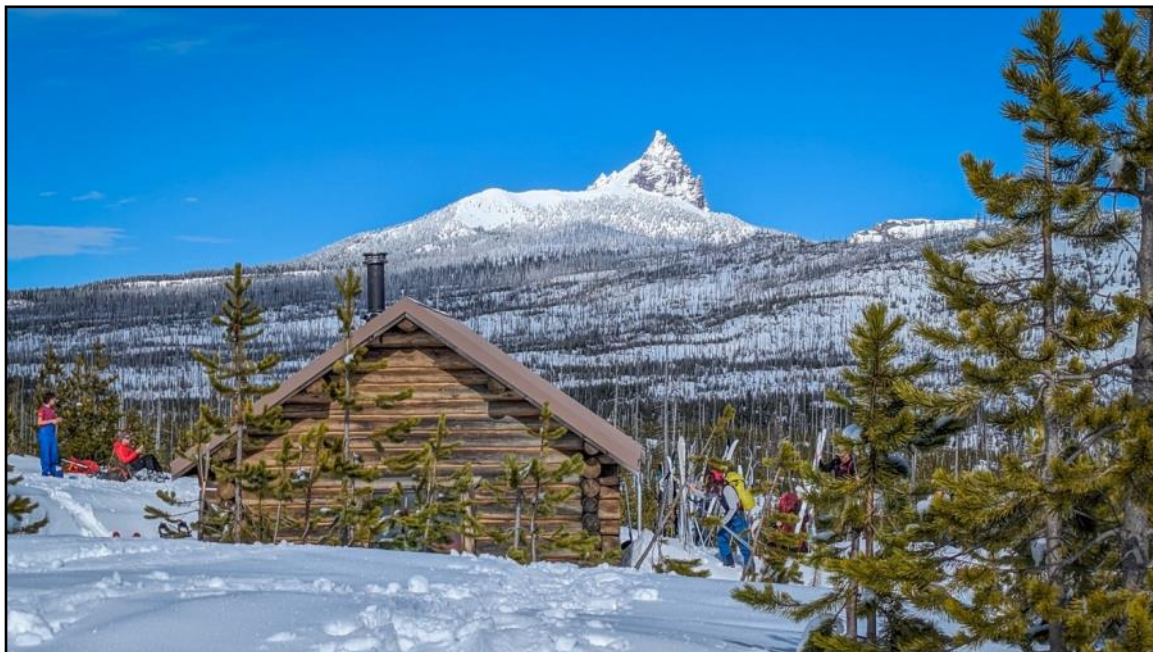
North Blowout Shelter with Three Fingered Jack. See the Ray Benson Sno-Park trip report on page 13.

ENJOY the photos in color! ONLINE Bulletin at www.obsidians.org