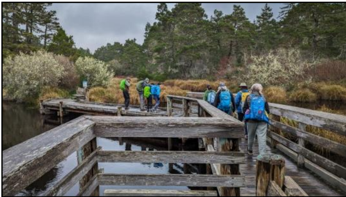
On the boardwalk of the Lagoon Trail, looking at newts.