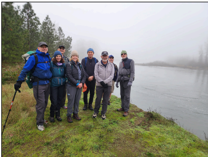
Obsidians on the bank of the Willamette River channel.