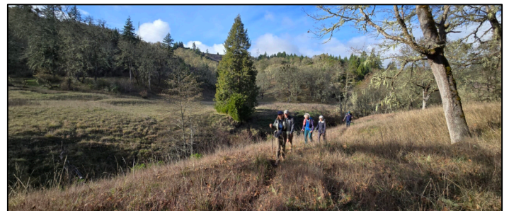
Obsidians enjoying a sunny afternoon.