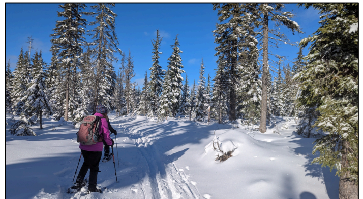
On the trail.