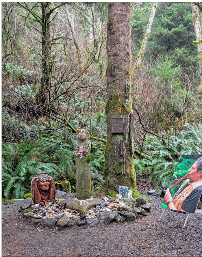
The Amanda statue in the Grotto honoring Native Americans, during the annual Yachats Peace walk.