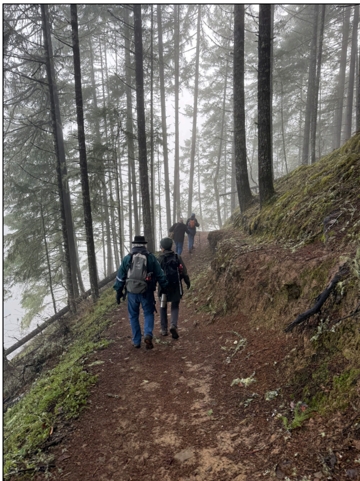
Trail in the mist.

SIX INTREPID OBSIDIANS BRAVED A DECEMBER MORNING CHILL to travel to Sutherlin, where we began our trek at the West Trailhead of the Cooper Creek Reservoir. Heavy fog and mist enveloped us and the trail, limiting the visibility at the start of our hike. Despite the fog and mud, the well-marked trail was easy to find and follow and provided some gentle ups and downs. A few downed trees and mud were minor obstacles. Soon the sun peeked through and we were treated to some warmth, better views, and a few bird sightings. We stopped for a quick lunch near the East Trailhead and continued on at a more rapid pace, finishing our trek back where we started, happy for the adventure, and ready for a hot drink at a local coffee shop. Participants: David Clinger, Whitney Gould, Andrew McIvor, JeanSylvain Negre, Rae Obrien, Guy Pritchett.