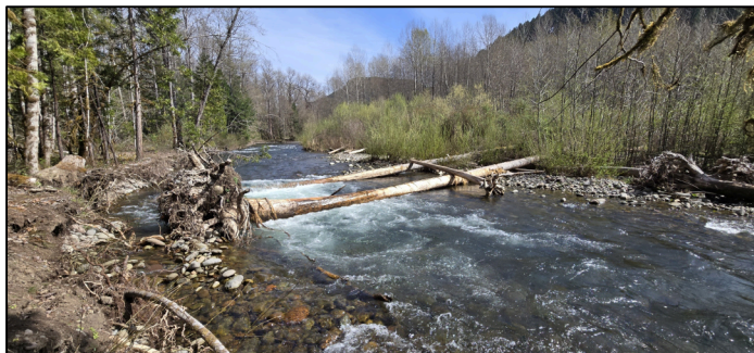
Beautiful Salmon Creek.