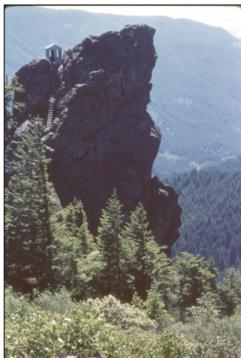
Rooster Rock pillar lookout in Menagerie Wilderness 1927–1953.