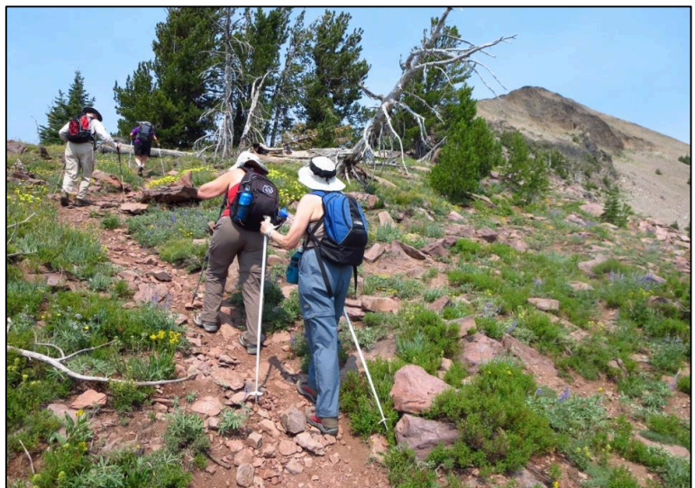
Hiking in the Strawberry Mountains, Summer Camp 2014.