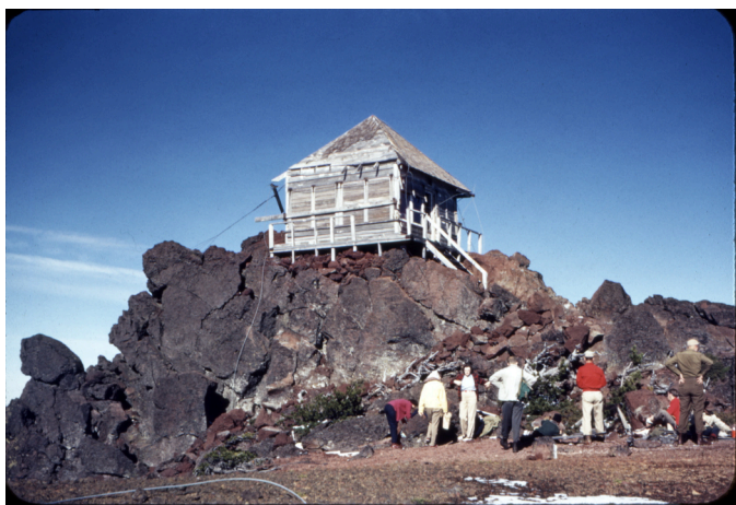
Black Crater Lookout 1923–1953.