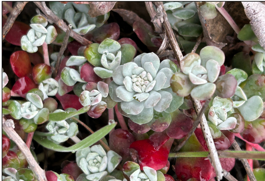
Sedum See the Thurston Hills trip report on page 8.

ENJOY the photos in color! ONLINE Bulletin at obsidians.org/newsletter