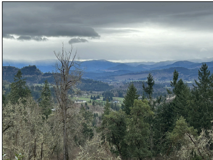
Verdant Thurston Hills.