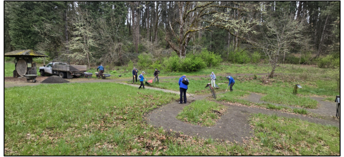
Removing grass encroachment from the walkway at the Oak Savannah Exhibit.