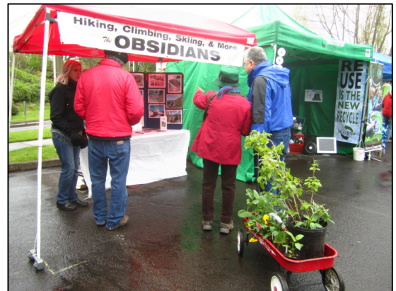
May 2014 Earth Day Event.