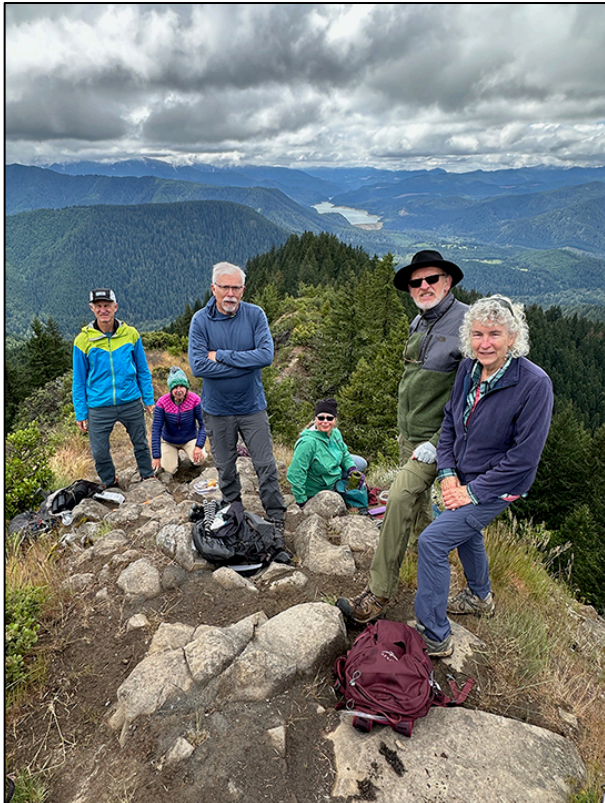
Atop Dead Mountain.