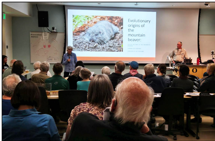
Audience ready for the presentation!

O UR GROUP OF EIGHT ENJOYED DINNER AT THE UNTHANK HALL FOOD COURT. There was enough variety that everyone was able to find something they liked. As we strolled to our talk, we felt the Friday night energy of a college