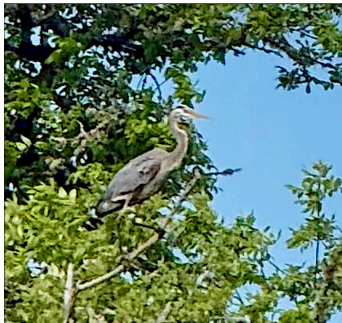
Regal great blue heron.