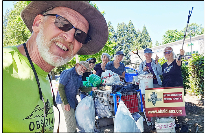
We picked up over 150 pounds of mixed rubbish.

the planet a little cleaner. Then imagine the very happy people picking up the trash. In 90 minutes, we picked up over 150 pounds of mixed rubbish. It was a bit of a festive feeling to leave a cleaner trail behind us, but it was too much for us to carry away. I called the City of Eugene Parks and Open Spaces hotline for help with the disposal but was redirected to an online form. Then Mari called the Lane County Public Works Department and after a few friendly redirects, she found a place and made arrangements for us to drop off the collected trash. Luckily, it was very close, so Angie and I walked there with all that trash towering over a shopping cart. Thank you, friends! Volunteers like you deserve a huge round of applause.