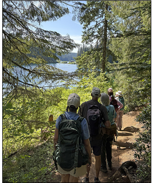
Clear Lake.

EVERYONE ENJOYED THE BEAUTIFUL, SUNNY DAY COMPLETE WITH PEEKABOO VIEWS of Mount Washington and the deep blue waters of Clear Lake. We weren't able to stop at Sahalie Falls