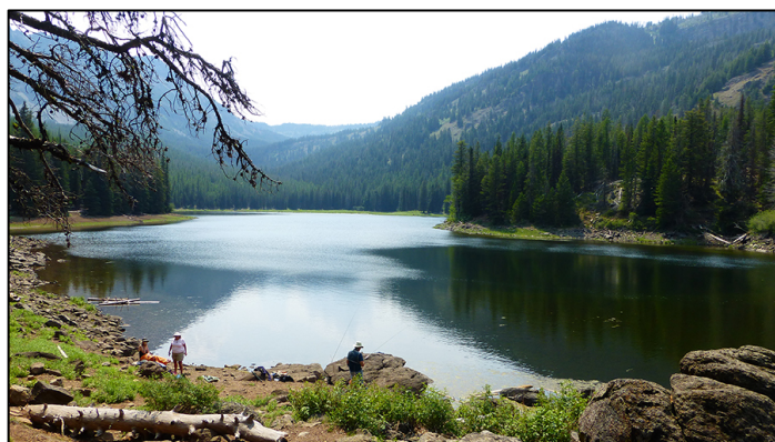
Strawberry Lake.

Finally, things cooled down—a lot. During the Pleistocene Era, only 1-2 million years ago, glaciers up to 1000 feet thick covered the Strawberry Mountains. As these glaciers advanced and retreated, they carved up the mountain into U-shaped valleys and rock beds that hold seven alpine lakes. If you hike up to Strawberry Lake, you'll be hiking up the terminal and recessional moraines those glaciers left behind. Strawberry Lake itself is a tarn, occupying a cirque—a bowl-shaped depression left behind by a glacier. If you hike up there on a sunny day, you can claim to have been to 'Cirque du Soleil'!