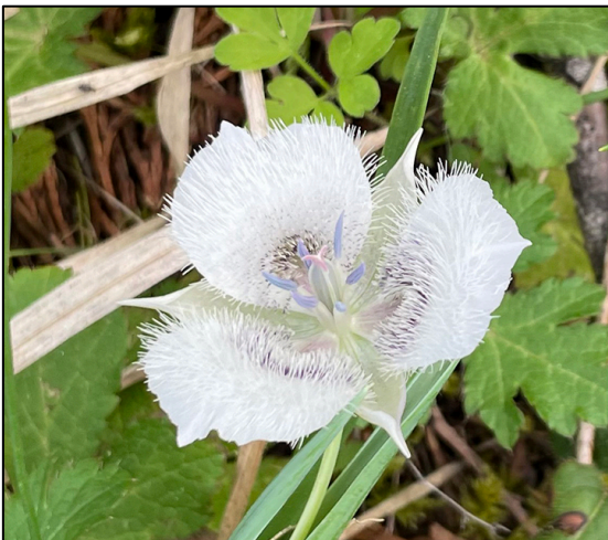
Tolmie's star tulip.

A RE YOU READY FOR A GAME OF NAME THAT EPHEMERAL WILDFLOWER? Bring along your curiosity! Eight wanderers search for wild blooms within the boundaries of