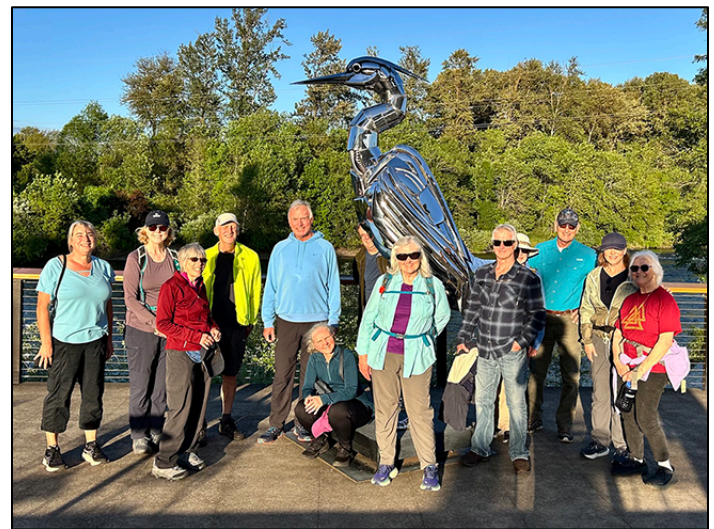
Willamette & Alton Baker Park hanging with the Heron!