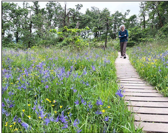
Visiting the Camassia Nature Preserve.