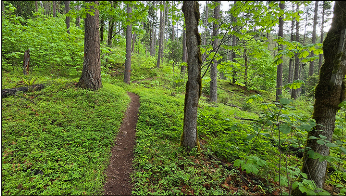
Trail #3566.

TODAY WE HIKED DEAD MOUNTAIN, NORTHEAST OF OAKRIDGE, originally known as Green Mountain (before the forest fires of 1883, 1898, and 1910). Our brisk 12.4-mile, 2,820-foot