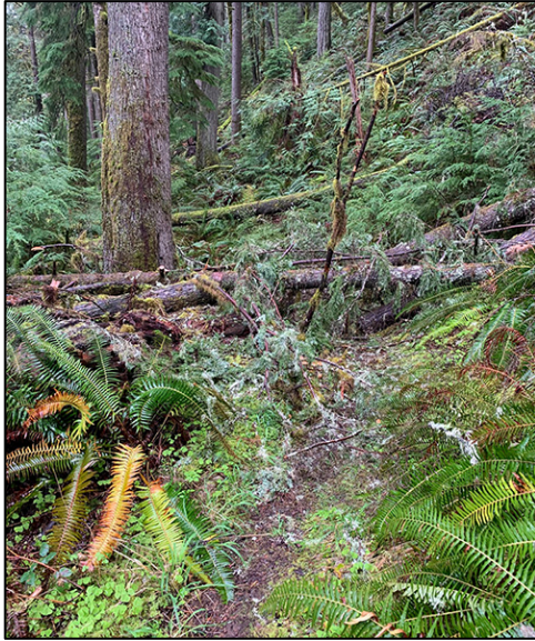
This was the mess on the trail.

I was looking at a mess. A mess to me is an inexact term I use for trail-blocking organic material: several broken large logs, assorted attached and unattached branches, other greenery, and mud, noting where it was—on the descent to Harper Creek on the South Willamette Trail (SWT)—and the size.