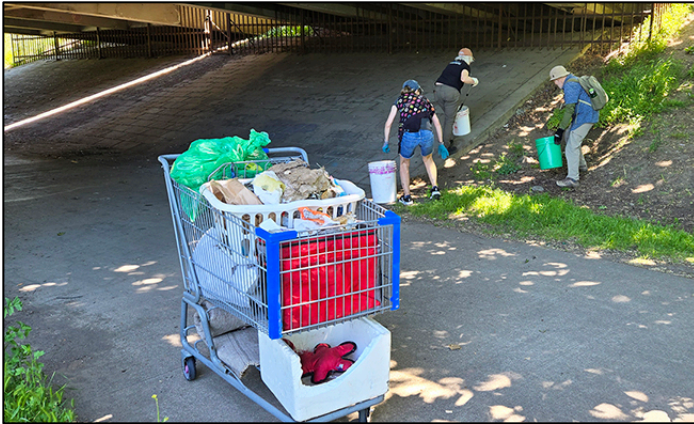
Obsidians cleaning under the bridge.

IMAGINE A PERFECTLY SUNNY MONDAY MORNING. Seven friends meet at the easternmost point of the Delta Path (corner of Delta Hwy. and Green Acres Rd.) to make this little corner of